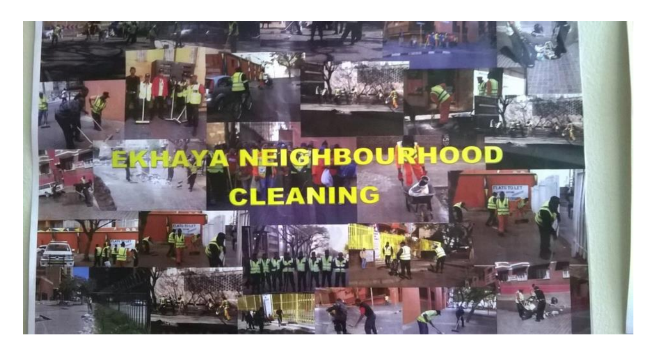
Image 1: Composite image of cleaning and maintenance activities undertaken by Bad Boyz.