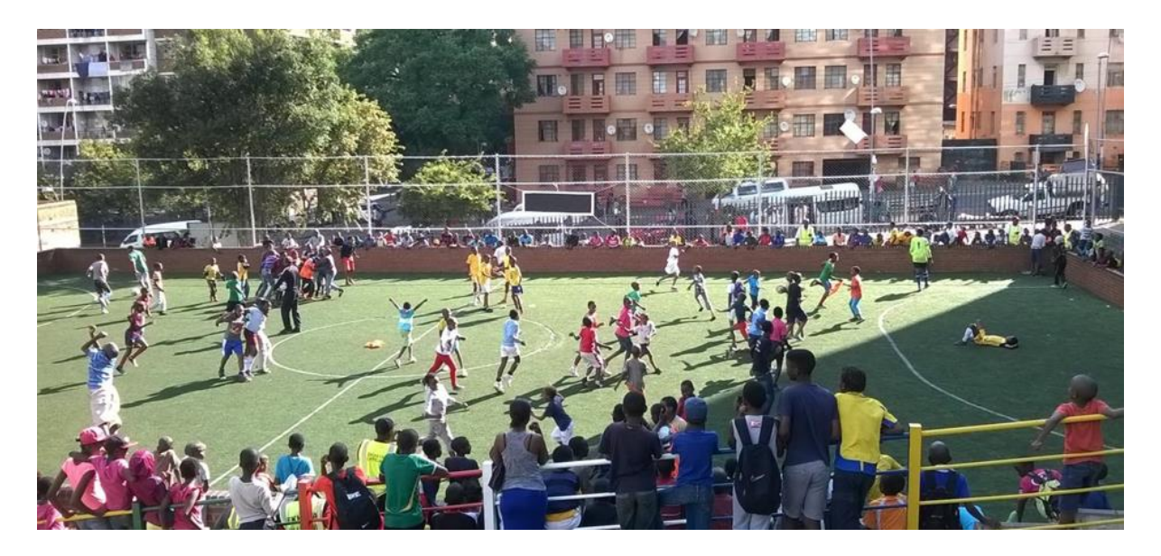
Image 3: Kidz Day Soccer Tournament at Ekhaya Park.

activities take place and help overcome some of what the current coordinator terms the "anonymosity" that contributed to the decay and violence which previously prevailed. This form of domestication, then, is not about attracting more affluent customers to space and taming it to maximize the profit which can be extracted; rather it is a process which serves to create spaces in which a broader form of ordinary communal life can be staged, in what was once a frightening and hostile terrain.