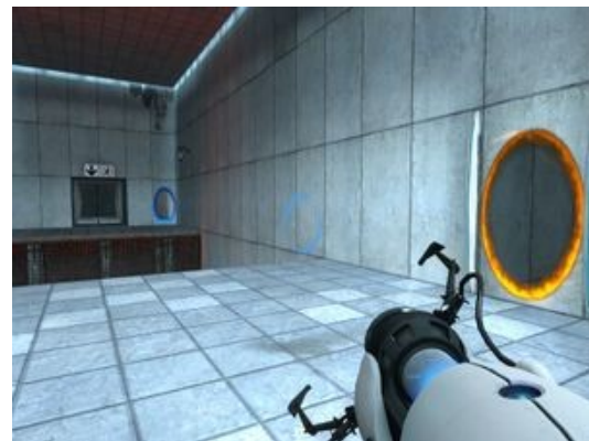
Figure 2: Level 3

The pattern of strategies employed by players experiencing major breakdowns was relatively consistent and serve as a clear indicator of when they were struggling. Gameplay primarily consisted of Trial & Error and Experiment strategies as players tried to understand the game world and rules. When experiencing difficulty, players often resorted to a combination of Trial & Error actions e.g. firing portals at different objects in the room, and Repetition , when they repeated the same action several times. In addition, the think-aloud indicated when they were forming incorrect hypotheses during Experiment , such as thinking that creating a blue portal in a different part of the wall would change the location of the exit. Occasionally, players would Stop & Think where they would become inactive in the game and reflect on what they were doing or looked at menus and external resources for further hints. If a player didn’t initially Take the Hint (in the form of visual in-game clues) but then went back to inspect them, this was seen as further evidence that they were struggling. In the subsections below, each level is introduced before examining the nature of the breakdowns experienced.