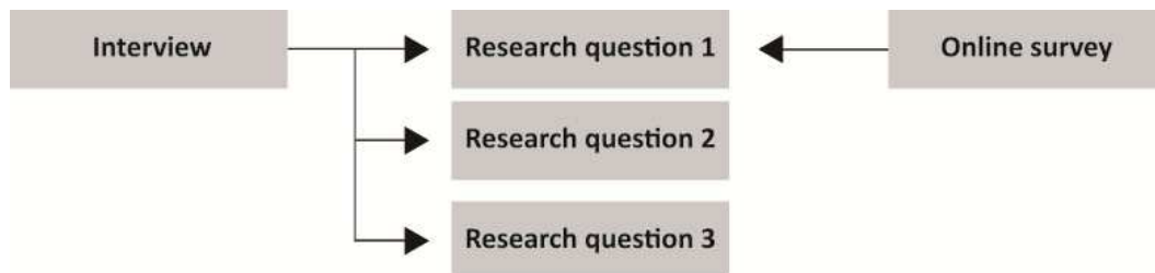
Figure 1: Data collection methods to answer research questions 1–3

As a primary data collection method, face-to-face interviews were designed to mainly answer research questions 1–3. An online survey was designed to supplement the findings from the interviews for the first research question (Figure 1).