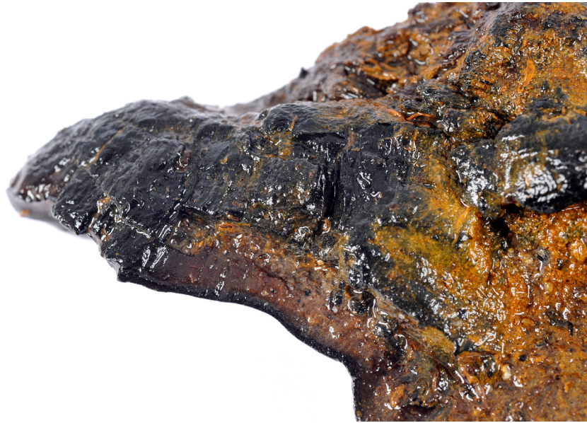
Figure 31.3: Close-up photograph of a charred Fomes fomentarius specimen that is likely to have been initially removed from the original fruit (Photograph taken by Paul Shields. Copyright University of York, CC BY-NC 4.0).