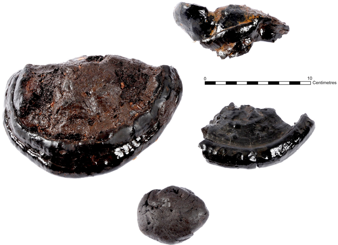
Figure 31.2: Photograph showing the three different species of fungus that were identified in the assemblage. Clockwise from top right: burnt Fomes fomentarius specimen, the one Phellinus igniarius specimen, the one Piptoporus betulinus specimen and a larger and modified Fomes fomentarius specimen that has had its outer surface intentionally removed (Photograph taken by Paul Shields. Copyright University of York, CC BY-NC 4.0).