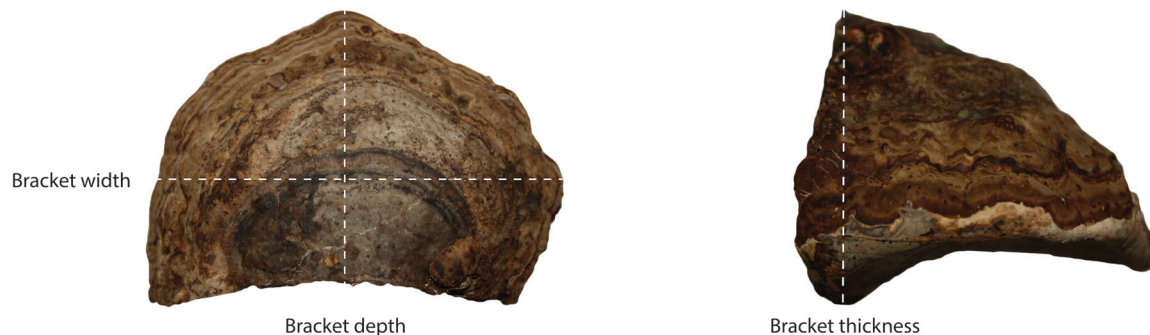
Figure 31.1: Photograph of a modern Fomes fomentarius specimen showing the measurements that were undertaken.

In total, 82 fungi were identified. Of these, 81 were derived from the more recent excavations undertaken at the site (Table 31.1). The other specimen was retrieved from Clark’s backfill by David Lamplough, a local volunteer, and gifted to the University of York in 2013.