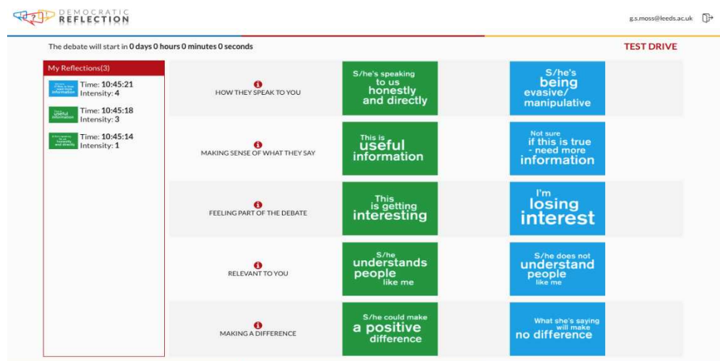
Figure 2. Democratic Reflection app, version 2.

Ahead of the 2017 general election, we designed a second iteration of Democratic Reflection that would address these issues. We reduced the number of response statements from 20 to 10 to make the task less complex, with just one positive and negative statement per capability. We also ensured the statements were more clearly distinct from one another. Some nuance may have been lost in this process. Still, comparing the software app to other real-time response methods, the responses available to viewers are still richer and relate to capabilities of democratic citizenship rather than simply to positive and negative preferences. The research team also felt it would be valuable to include a measure of intensity, enabling viewers to express how strongly they supported a particular statement. The app uses the length of time people hold a card as a measure of intensity, with a scale ranging from 1 to 5. Figure 2 shows the design of the second version of the app.