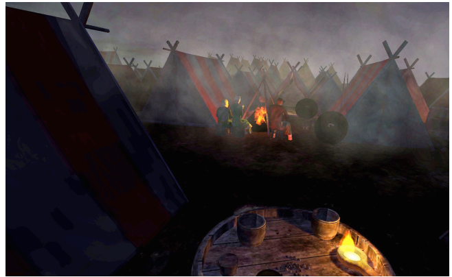
Figure 6: A firelit scene.

Although it was relatively simple to establish a workflow through which artists and experts could collaborate in developing individual objects, it was far more difficult to develop and assemble the scenes collaboratively. We attempted to plan each vignette through maps of the scene but found that these could provide only the most basic indication of what the user could see. As each scene was blocked out, it became more difficult to communicate what it felt like to inhabit and could only be meaningfully understood and discussed using an HMD. We attempted to use 360-degree video and stills from multiple viewpoints but even these were of little help, missing as they did the differentiation between foreground and background objects apparent in the stereoscopic 3D scene.