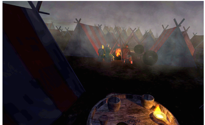
Figure 6: A firelit scene.

Although it was relatively simple to establish a workflow through which artists and experts could collaborate in developing individual objects, it was far more difficult to develop and assemble the scenes collaboratively. We attempted to plan each vignette through maps of the scene but found that these could provide only the most basic indication of what the user could see. As each scene was blocked out, it became more difficult to communicate what it felt like to inhabit and could only be meaningfully understood and discussed using an HMD. We attempted to use 360-degree video and stills from multiple viewpoints but even these were of little help, missing as they did the differentiation between foreground and background objects apparent in the stereoscopic 3D scene.