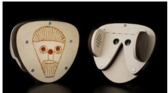
Figure 4: A finished headset

We designed the headsets to be held up to the face for use, rather than being strapped to the head. We realized that by eliminating straps altogether we could not only solve the problems of health and safety and robustness discussed above but we could also encourage a different, less isolating experience. We reasoned that this headset could be easily passed from visitor to visitor, encouraging discussion and the sharing of experiences.