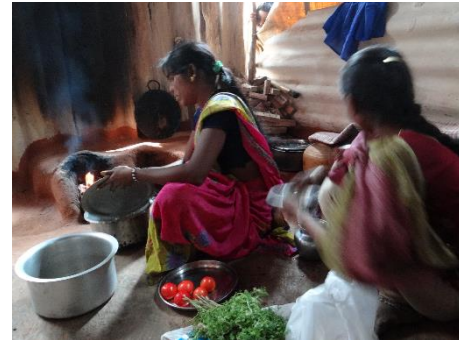
Figure 1. Two women cooking on traditional stoves

To answer novel questions that arose after the initial visits, we organised cooking sessions in each slum. The designers and we were welcomed by cooks, who were nearly exclusively women, in their homes. While cooking their daily dishes (Figure 1), they discussed with us their practices