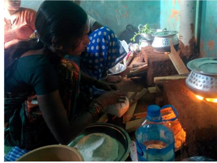
Figure 5. Two participants using and discussing the characteristics of two different prototypes

a non-disruptive approach to ICS development. In order to avoid shifting the centre of activities outside of the slum, we used an unoccupied house in Peenya as a makeshift laboratory for experimentation, with the consent of local slum leaders. There, rather than introducing a ‘foreign’ product, far from the ‘ideal’ versions of stoves built during the foam modelling workshops, we encouraged slum residents to build several chulhas similar to the ones used in their own homes. From this starting point, the designers made small, cumulative technical modifications to the chulhas . These changes were complemented upon during workshops by feedback from people in the slum, who were encouraged to cook on them and share with us feedback regarding their usability (Figure 5). By building upon the chulhas constructed by residents in Peenya, a sense of ownership over the process was instated, as the women involved were curious about the changes made to their own chulhas . In addition, we left the house key with a woman living in its vicinity, who could let in anyone who wanted to try the stove at their own convenience. For trials, we provided participants with ingredients bought from local markets which they used for habitual dishes like dal, rice, chapatti and sambar. They used their own firewood in order to account for the specific types of wood that are locally available.