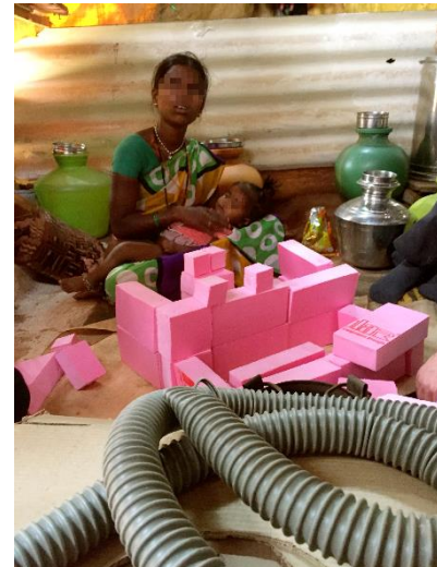
Figure 4. Participant building 'ideal' stove from foam bricks and other materials

ICS by employing visual cues of concepts. However, the conceptualization exercises led to little progress and proved to be too abstract and ineffective, necessitating the use of more tangible approaches. We asked the participants to build 'ideal' stove prototypes with the use of foam bricks, plastic pipes and cardboard (Figure 4). However, we observed that the 'ideal' stoves built were mere reflections of the chulhas the residents of Peenya and Sumanahalli slums were currently using, which, the designers reasoned, was due to the slum inhabitants' internalization of the cooking equipment and cooking experience over the course of many years of practice. In spite of the initial difficulties in finding