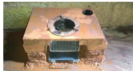
Figure 8. Two designs: The first, (top) built for maximum visibility released more pollution, and the second (bottom) contained the smoke better but conferred poorer visibility of flames during cooking

we should add small knobs around the prototypes' hob, onto which the vessels would rest during cooking- a component they normally added on their traditional stoves. The users' reasoning for this addition was that the fire needed to escape from the stove chamber and engulf the sides of the pot for an increased efficiency. It could also be argued that this space would permit an air channel within the fully enclosed traditional clay chulha. On the prototype they were using, however, the required oxygen supply was provided through the inner workings within the stove chamber which were