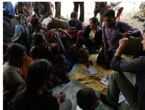
Figure 3. Animated prioritization workshop in front of a tea-shop in Peenya

In order to ensure that the community had a consistent presence and voice regarding the direction and focus of the project, and to avoid a prolonged absence from Peenya and Sumanahalli, regular community forums were held in the slums (Figure 3). The main aims of these forums were to discuss with slum residents the information gathered thus far, to define priorities for the project and the ICSs, and to decide upon ways of meeting these priorities. We recounted with them smoke-related discomforts, fuel accessibility and cost,