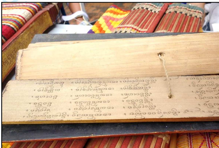
33 34 35 36 37 38 39 40 41 42 43 44 45 46 47 48 49 50 51 52 53 54 55 56 57 58 59 60 Figure 1: LannaTham script recorded on a palm leaf manuscript