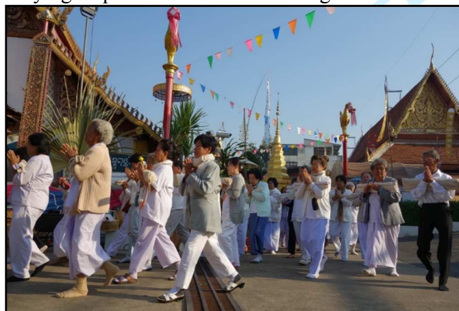
53 Figure 5: Triple circumambulation, without shoes, performed by local people and visitors of all 54 ages and genders in the TakTham ceremony 55 56 57 58 59 60