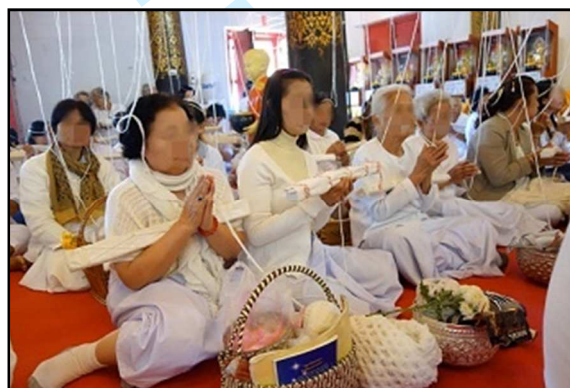
38 Figure 4: Paying respect to the Buddha during the TanTham ceremony

20 21 "80% of local people, especially old people, see PLMs as sacred objects because they belonged to the previous abbot 22 (Kruha Mahapa Kesarapanyo) who was respected among local people. The other 20%, mostly students, middle-aged 23 people and teachers, see PLMs as knowledge. Possibly, in the future, the academic-related viewpoint might increase to 24 50% and be equal to the sacred view." 25