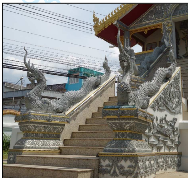
Figure 3: Stuccowork depicting Himmaman creatures

In the past it was only men who were involved in use of PLMs (apart from weaving covers, which was a female role). Formally this has changed, though men still seem to have priority in managing them, perhaps because the monasteries are patriarchal institutions. And permission was still needed to look at PLMs and their security controlled by abbots, monks and the guards who held the keys to temple buildings; visitors had to ask their permission before entering to see PLMs. Community members wanted access to be easier: