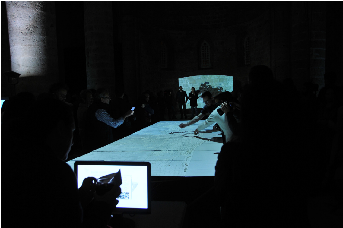
Fig. 3: The portable physical model as a material agent for reconciliation, courtesy of Hands-on Famagusta .