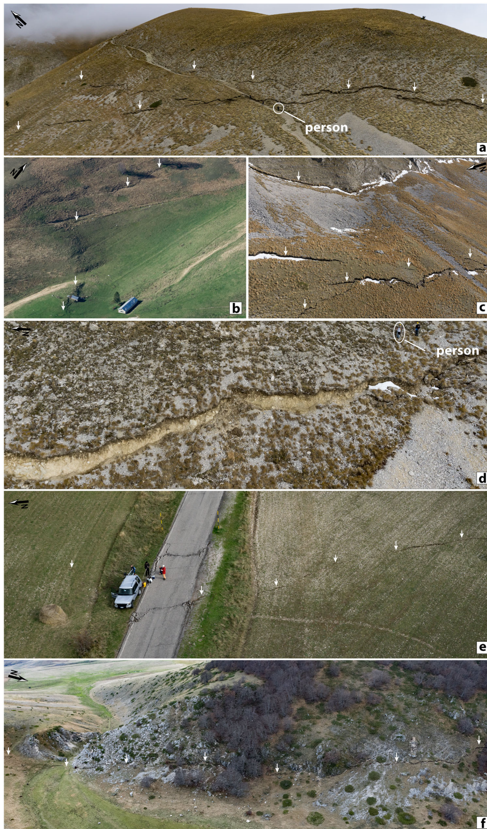
Figure 2. Examples of coseismic ruptures along the Mt. Vettore–Mt. Bove fault system as seen from helicopter surveys. White arrows mark the trace of the surface ruptures. (a) View of the continuous and stepping splay of the coseismic ruptures along the western Mt. Vettore flank (42.8083 N, 13.2630 E); (b) antithetic coseismic rupture in the middle sector of the VBFS (42.8489 N, 13.2213 E); (c) set of parallel coseismic ruptures along the western Mt. Vettore flank (42.8261 N, 13.2454 E); (d) Cordone del Vettore ruptured splay (42.8165 N, 13.2554 E); (e) coseismic ruptures along the Piano Grande di Castelluccio fault splay (42.8194 N, 13.2230 E) and (f) antithetic coseismic free-face following a cumulative fault scarp in both bedrock and alluvium (42.8531 N, 13.2119 E).