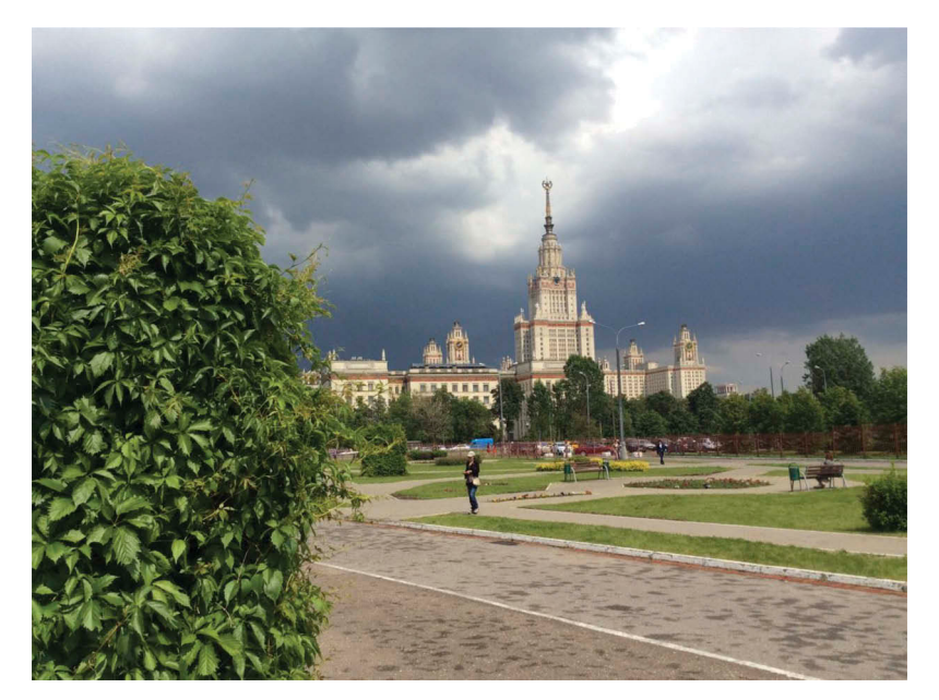
Figure 1. The Lomonsov Moscow State University, viewed from the conference building.