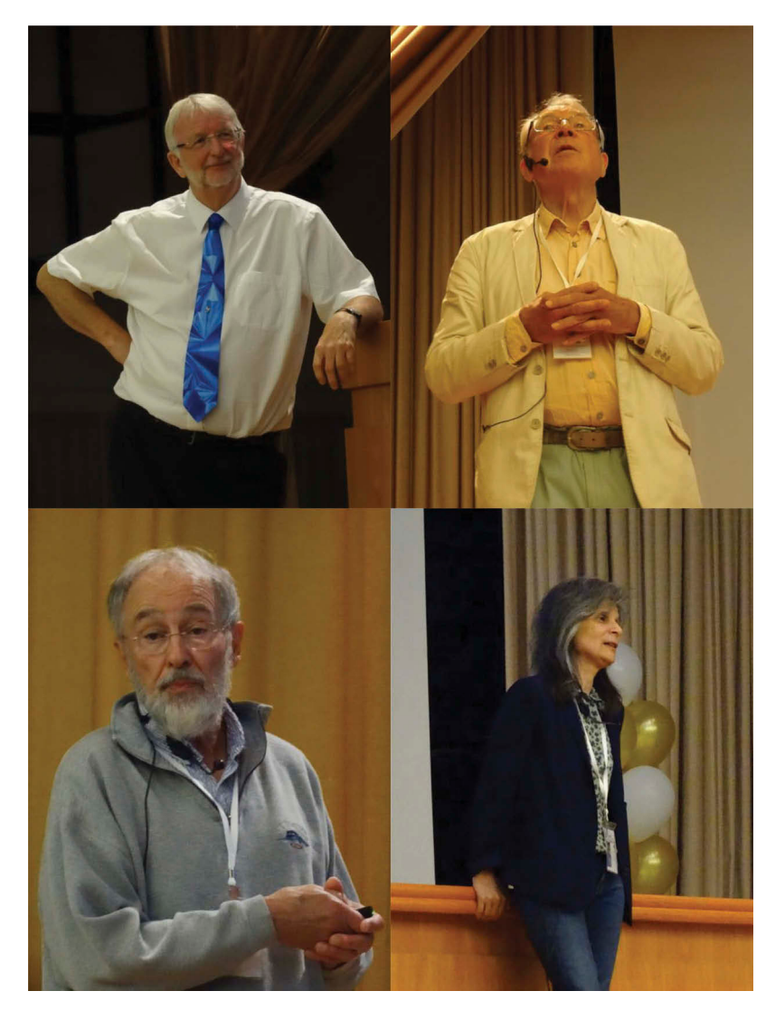
Figure 4. Plenary lectures presented by John Goodby, Sven Lagerwall, Noel Clark and Maria Gordinho.

calamitic liquid crystal when hydrogen bonded to vitamin D. De Santo presented an electrically tuneable multi-colour cholesteric laser, wherein droplets of each wavelength were initially formed in separate emulsions. D. Gorkunov showed how sub-micron pitch metal gratings can be used to produce fast switching effects for polarised light close to the plasmon wavelength for the grating. The SEM of an in-plane electrode structure with a 100nm gap and 300nm pitch was particularly impressive. Zyryanov reviewed the various anchoring transitions that are possible using ionic surfactants, with a particular focus on achieving the inverse mode (nonscattering in the off state) polymer dispersed liquid crystals for application in smart windows. LC droplets were also used by Dubttzov, who combined azo-dyes with nematic LC to create biological and chemical sensors, finding that the critical for the light induced