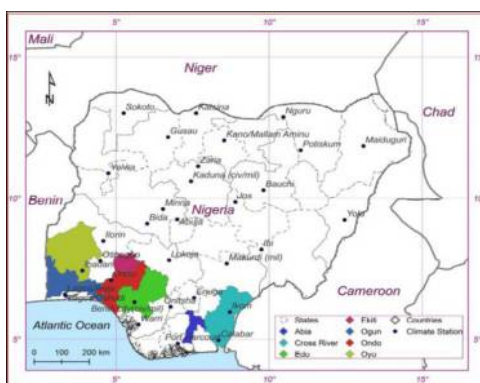
Figure 1. Cocoa-producing states used for the study