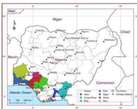
Figure 1. Cocoa-producing states used for the study