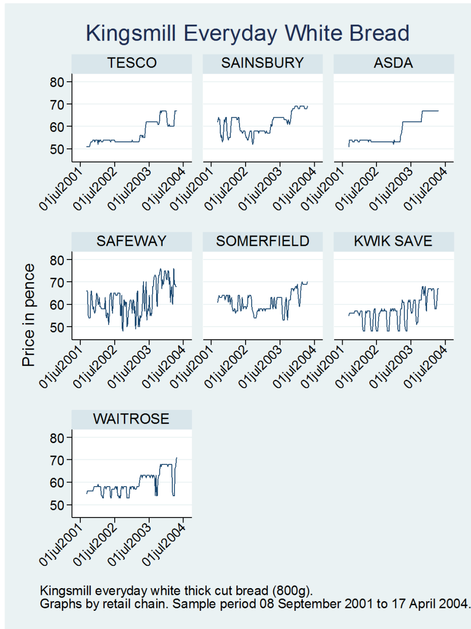
Figure 1: Weekly Prices (pence) of Kingsmill Everyday White Bread across All Major Food Retailers

and Midrigan (2012), Guimaraes and Sheedy (2011) and Coibion et al. (2013) address these issues. To account for this, recent empirical studies employing high-frequency price data seek to remove sales from price series.