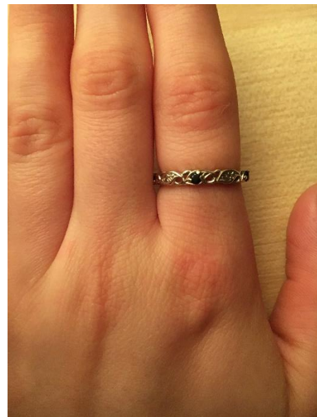
Figure 2. A) A 3d printed elephant and B) An eternity ring, described by respondents in our survey.

Object attachment results from a deep-seated psychological need for emotional support, a need which is not always fulfilled by other people and which is not merely a representation of a modern, capitalist obsession with material things. Rather, attachment objects function for the benefit of our well-being, prosociality and ability to adapt to adverse circumstances (Keefer et al. 2012; Keefer, Landau, and Sullivan 2014; Mikulincer and Shaver 2007; Mikulincer, Shaver, and Rom 2011).