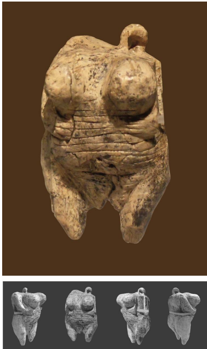
Figure 4. The Hohle Fels 'venus' (Height 6 cm).

There are however other perspectives. In reference to similar ivory sculptures of female figures, found at Nebra in Germany, Jill Cook of the British Museum notes that 'given the skill and time required to produce the figure it seems an unlikely example of adolescent sexual awakenings and the deposition in the pit suggests some wider social, ritual or ceremonial significance' (Cook 2013, 238). The same can be said of the 'Venus' of Hohle Fels. The intricacy and time spent creating and curating these objects gives weight to the idea that they may have had emotional significance, and encouraged emotional attachments. Moreover 'Venus' figurines tend to depict mature women, rather than young