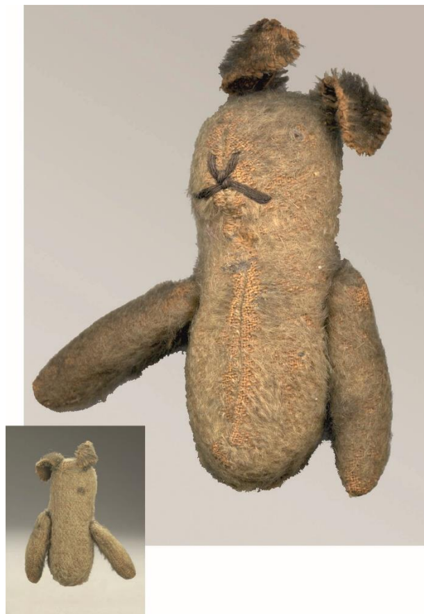
Figure 1. The Rogers teddy bear (Length 12.2 cm, Width 9.0 cm, Depth 3.0 cm) produced 1910-1915. Rear view below.