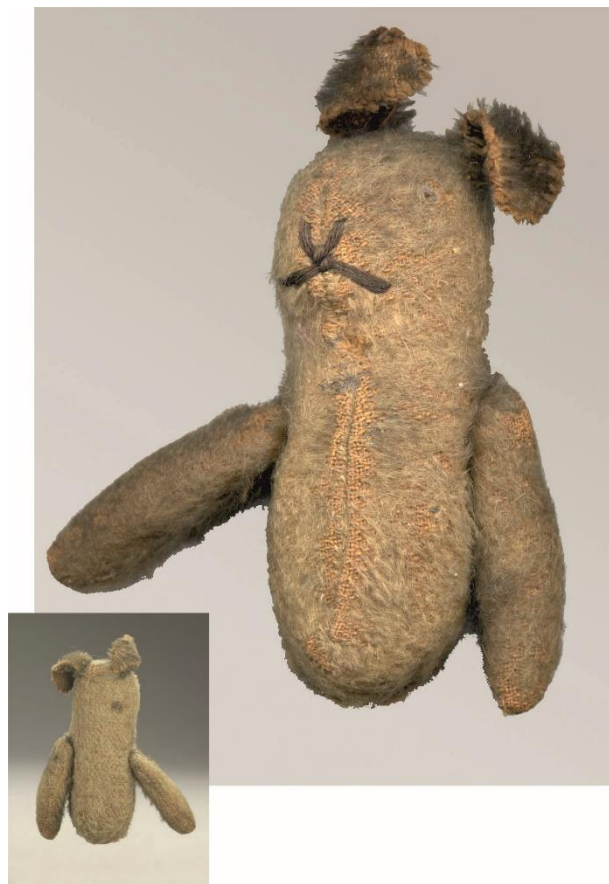
Figure 1. The Rogers teddy bear (Length 12.2 cm, Width 9.0 cm, Depth 3.0 cm) produced 1910-1915. Rear view below.