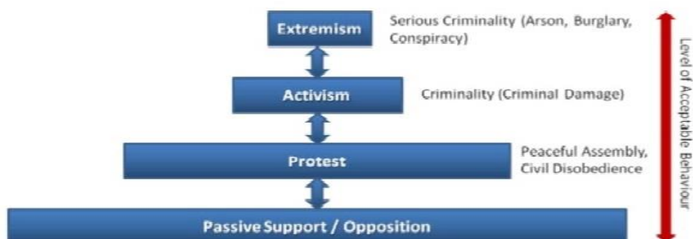
Figure 1 – The Structure of Protest, taken from ACPO (2015) Policing linked to Onshore Oil and Gas Operations , London: National Police Chief’s Council, 8.

The diagram and explanation are included as part of a discussion about the benefits of establishing good relationships with protesters and local supporters at anti-fracking protests, in line with the commitment to dialogue. The breakdown of the structure of protest here though defines protest in terms of accepted tactics in distinction to activism defined by criminality. Here the divide between these groups mirrors the distinction drawn between ‘contained’ and transgressive protest that Gillham (2011) argues has been central to targeted protest policing in the US in recent years. Indeed, the Network for Police Monitoring [Netpol] have pointed out, ‘the guidance proposes that these categorisations will be used to ‘tailor’ police responses’ (2015a: 9).