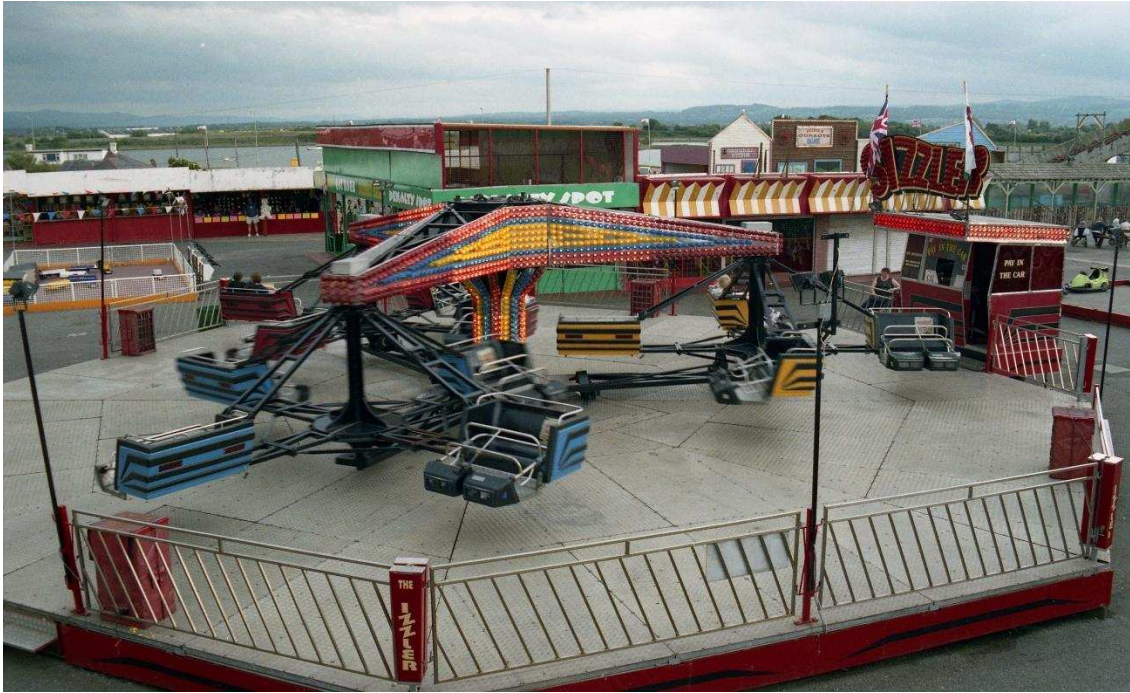
Figure 1 – Twist ride with inward facing speakers visible