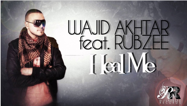
Figure 5. Wajid Akhtar Heal Me (Fair Use screenshot from YouTube. Accessed December 5, 2017. https://www.youtube.com/watch?v=IKNwgbeHHE ).