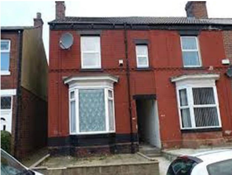
Figure 3. Venue for the Sheffield mawlid with Shahid Mahmood.

This part of Sheffield is the traditionally working-class side of the city, though much of the 'work' (steel) which brought people here has disappeared. The young people in the image all speak a variety of Yorkshire English which in certain contexts has one or more ethnolect variations. 9 Many of them have confident proficiency in Standard English spoken with a northern England accent (South Yorkshire variety). In terms of English alone there is already significant complexity here. Moving between these different varieties is fairly standard practice for these youngsters as they navigate their lives through family, community,