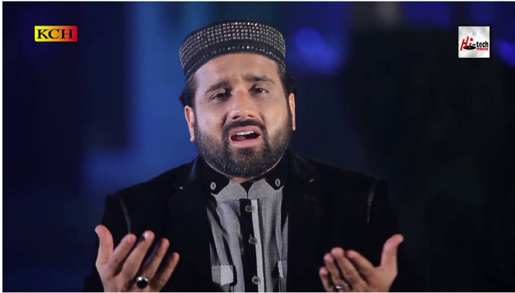
Figure 1. The naat khawan , Shahid Mahmood (Fair Use screenshot from YouTube. Accessed December 5, 2017. https://www.youtube.com/watch?v=d5Yedxhw3zg ).