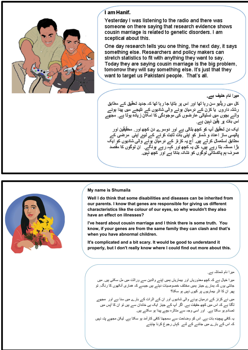
Figure 2 Contrasting personas

Two workshops (one mixed sex and one single sex) were conducted. Each workshop was attended by 14–16 participants. The objective of these workshops was to obtain detailed feedback on the prototype resources in relation to their tone, adequacy, readability/comprehensibility, believability and acceptability. The research team and participants critically reviewed the leaflet line by line and