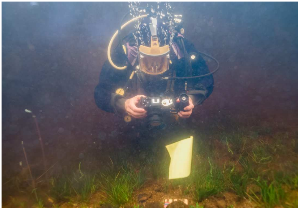
Figure 2. The first author recording Neolithic material in NW Scotland. Scientific diving is a distinct form of professional diving, distinct from both recreational diving and commercial diving.