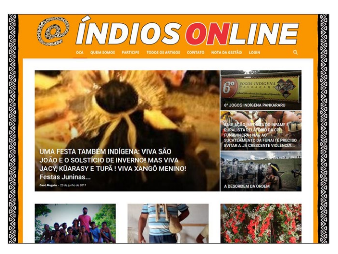
Figure 5: The Índios Online homepage over time, 5 July 2017.

century — 1940s onwards, and most notably since the late 1970s, with a 'third wave' of remergence since 2002 — as various laws were passed in Brazil making it possible and desirable to reassert a community's indigenous or African-origin, quilombola [maroon] identity in order to gain land and other social rights, that self-identifying indigenous groups have re-emerged in this region (Arruti). While a few of the groups involved in Índios Online re-emerged in the 1940s (the Pankararu, the Kariri-Xocó and the Xucuru-Kariri), the others are of more recent re-emergence (for example, the Tupinambá and the Tumbalalá re-emerged post-2002). While the older groups may no longer think of themselves in terms of re-emergence, factors affecting all groups include small numbers of people per community — 1,200—8,500 people each in 2014 according to the Brazilian Sistema de Informação da Atenção à Saúde Indígena [Health Information System for Indigenous Peoples] ( Povos Indígenas ) — a concertina-like process of the splintering of groups to form new ethnicities and the combination of others to form hybrid ethnicities, always with a focus on the assertion of 'ethnicity', plus dispersion of these groups across a large geographical area where they are also in close contact with mainstream society, and therefore an ongoing 'battle' for space, both conceptual and real.