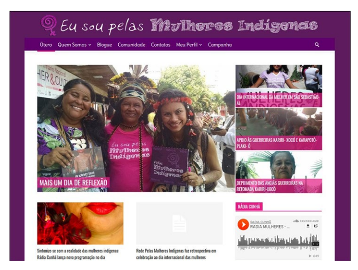
Figure 11: Pelas Mulheres Indígenas website, 7 July 2017.

community. Thus, it does not seem reasonable to draw the conclusion that the level of input from indigenous women in the development of these websites, and the association of certain activities with a particular gender, makes a significant difference in terms of the poetics used, though it may have made some.