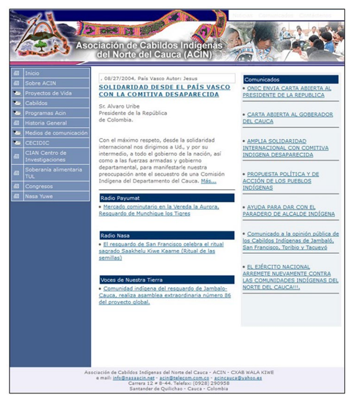
Figure 6: The ACIN webpage since 2004, 28 August 2004.

The ACIN has had a web presence since a page in its name was first set up in 2002 by the Centro Internacional de Agricultura Tropical (CIAT), as a by-product of a project to set up telecentros for and with three different communities in the South-West, including one in the ACIN's headquarters in Santander de Quilichao. This website was a page within the CIAT's own website and was initially set up and maintained by CIAT staff with input from ACIN for texts and images. From 2003, the organisation had a website of its own that was hosted on the server of the NGO Fundación Colombia Multicolor, an organisation focused on enabling socially marginalised communities to access and use new communication tools, and maintained in part by the foundation and in part by ACIN members. And from 2004 onwards the organisation has had its own website, built using Dreamweaver software, hosted independently on their own server and maintained exclusively by ACIN members (see Figures 6–10 for the development of the site since 2004).