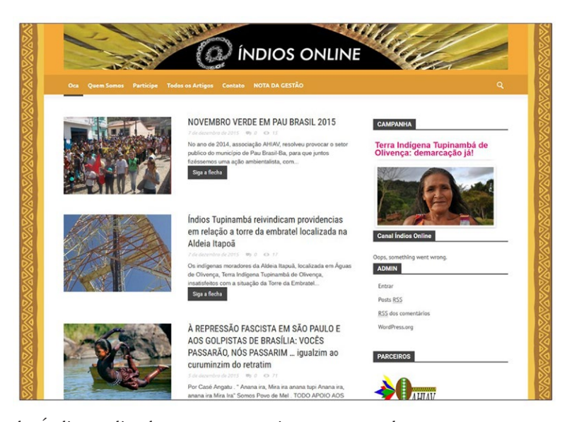
Figure 4: The Índios Online homepage over time, 10 December 2015.

and international, popular and academic, pan-indigenous discourse (Warren 157–63).<sup>13</sup> In the case of the indigenous communities involved in the Índios Online project, by the 1870s the Brazilian government had declared the formal extinction of all indigenous, as well as Africanorigin, peoples in the Brazilian North-East: this region – the coastal fringe and the arid hinterland, the Sertão – was the locus of the most intensive colonisation efforts in Brazil and is generally considered the crucible of mestiçagem [miscegenation] between blacks, whites (Portuguese and Dutch) and indigenous groups (French 17–42). It was only during the last