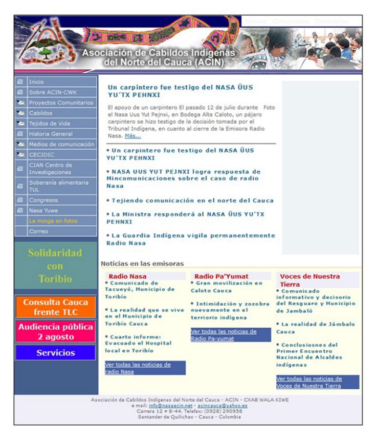
Figure 7: The ACIN webpage since 2004, 28 July 2005.

The full title of the site in its current iteration reads Asociación de Cabildos Indígenas del Norte del Cauca: Çxhab Wala Kiwe/Territorio del Gran Pueblo (the subtitle in Nasa Yuwe and in Spanish reads, 'land of the great people'), and despite ups and downs, it is still active at the time of writing, in a recently redesigned format on WordPress. <sup>18</sup> The older version of the site active until early February 2017 indicates that it had over 15 million hits, and since the early 2010s the site has also had links to the organisation's presence on social media sites such as Facebook, Twitter and YouTube, indicating its willingness to modify its communication strategies to keep up with the times. As with the Índios Online website, the ACIN's website has become slicker and more sophisticated in design over time. Although the new format might be found to be a bit more 'light', a bit more focused on news and denunciation than on critical reflection around the organisation's purpose, it is nonetheless clear that it still places significant importance on representing the functionality of a coordinated and determined organisation, and as a result it remains quite text heavy and busy in its concern to ensure visibility for all its functions.