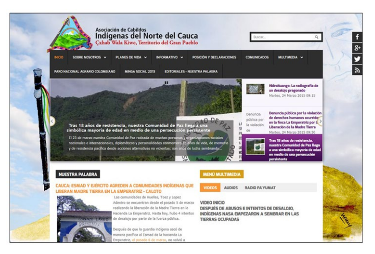
Figure 9: The ACIN webpage since 2004, 25 March 2015.

The ACIN's communication strategy amounts to much more than just a website, and includes their own media (such as oral storytelling around the hearth or weaving)<sup>19</sup> as well as appropriated media – they have three community radio stations, a video production team and various forms of printed communication (Murillo 158). What brings it all together is a unified purpose expressed in the various different 'planes de vida' [lit. 'life plans'] of the communities that make up the association. These plans are particularly focused on sustainability and autonomy from the Colombian state's version of development, sustainable or otherwise.