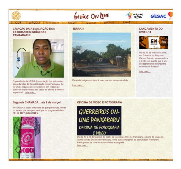
Figure 2: The Índios Online homepage over time, 2 March 2009.

Before going on to look at the group's preferred tropes for the appropriation of new media technologies, I want to briefly examine the context in which this group took to the internet. This context has two main components: firstly, the 're-emergence' of indigenous groups across the world, and in Brazil in particular, and the importance of new media technologies for the most recent 'waves' of this; and secondly, the political project of 'digital inclusion' in Brazil.