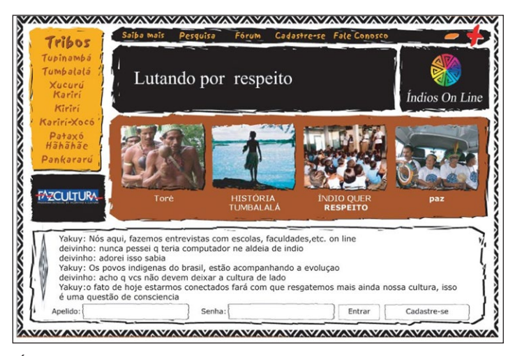
Figure 1: The Índios Online homepage over time, 2004.