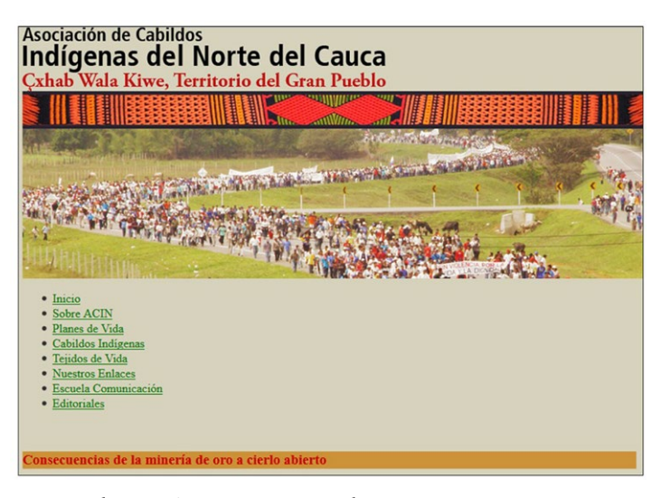
Figure 8: The ACIN webpage since 2004, 2 March 2011.