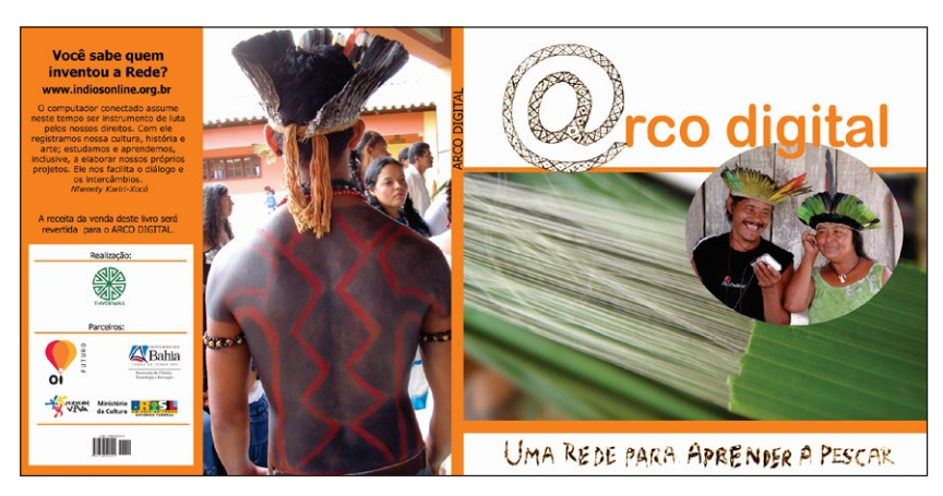
Figure 12: The front and back cover of the book @rco digital (2007).

frame his reference to 'the net' in such a way as to challenge the endless colonialist rhetoric surrounding the invention of networked digital technologies and the consequent occupation of cyberspace framed as 'homesteading on the electronic frontier' (cf. Rheingold). What this mainstream colonialist rhetoric achieves is, according to Ziauddin Sardar, a rerun of the Conquest without the inconvenience of there being anyone in the way, and it thus allows the white, Western internet-user the fantasy of being both cyber-conquistador and digital native. Instead, in Nhenety Kariri-Xocó's formulation indigenous people become first-come in cyber-space. Taken together then, these two examples indicate that the limited range of weaving poetics used by the Índios Online group works to support the more dominant hunter-warrior discourse: they are still part of the 'go-get-it' and combative political repertoire.