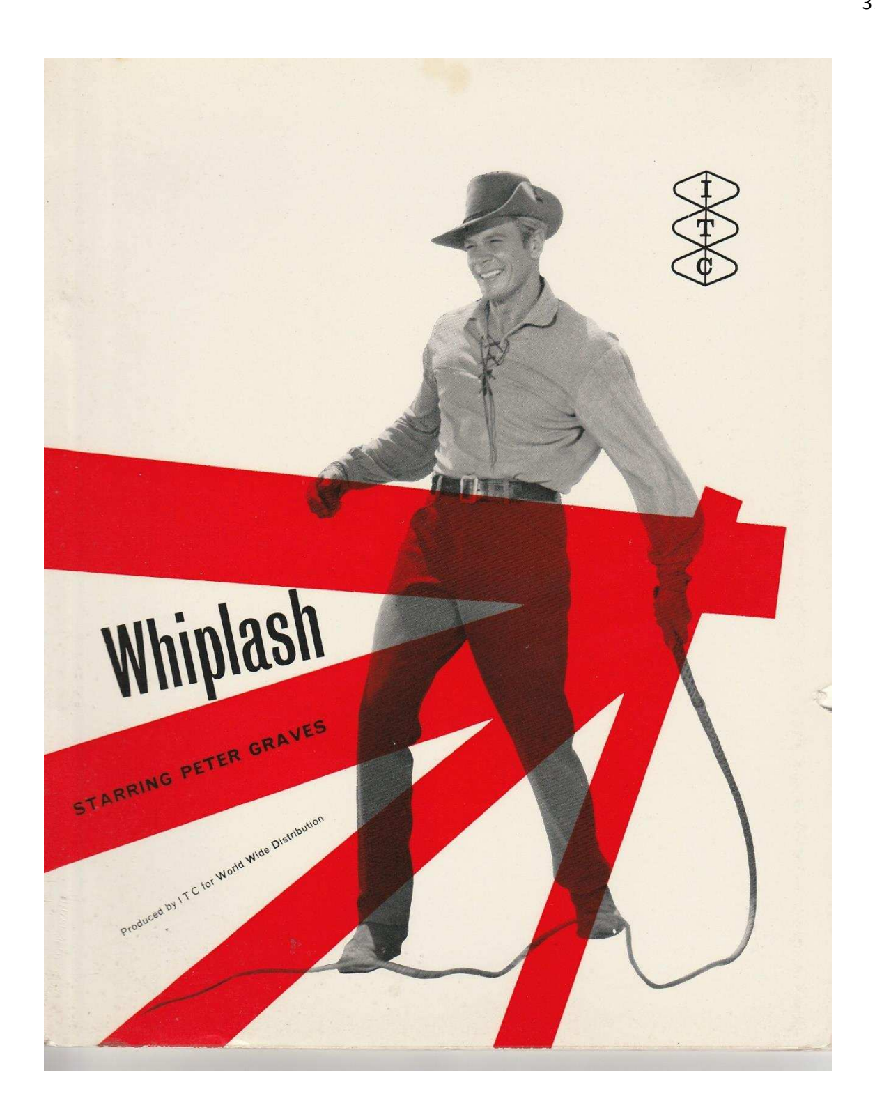
Bible Type F: sales document, c.1961. Whiplash (1960-61)