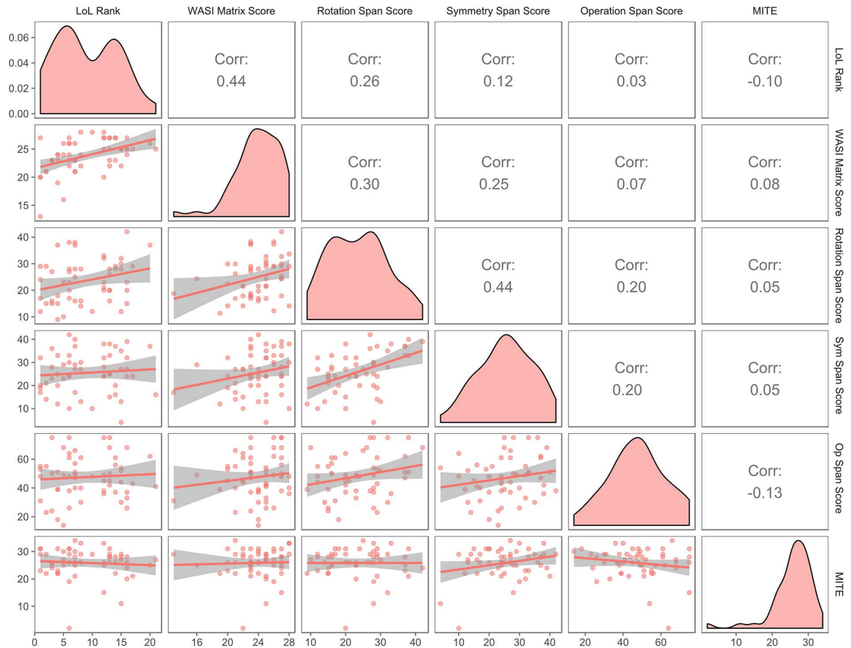
Fig 1. Cross correlations between variables of interest. The leading diagonal shows the distribution of the data. Numbers above the diagonal show the non-parametric cross correlation coefficient. Scattergrams of the data with best fit lines and error limits are shown below the leading diagonal. There is a moderately-sized and highly significant correlation between WASI-II Matrices and Rank ( r_s = .44, p = .001 ) and a weak but significant correlation between Rank and Rotation Span score with r_s = .26, p < .05 . The correlations between Rank and OSPAN and MITE task scores were not significantly correlated with with r_s = 0.3, p = .43 and r_s = -.01, p = .242 respectively.

https://doi.org/10.1371/journal.pone.0186621.g001