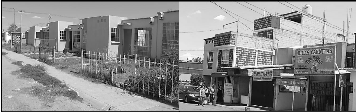
Image 1: Abandoned housing in Paseos de San Juan (left) vs. adaptation of housing in Los Héroes (right)

transformation of their façades, and many owners have modified the design and size of their housing, adding second, third and fourth floors to expand living space (see Image 1). There are several real estate companies that offer their services, and the presence of an increasing diversity of urban amenities turns the area visually into a more integrated part of the urban fabric.