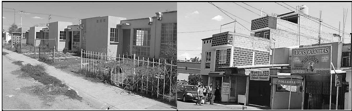
Image 1: Abandoned housing in Paseos de San Juan (left) vs. adaptation of housing in Los Héroes (right)

transformation of their façades, and many owners have modified the design and size of their housing, adding second, third and fourth floors to expand living space (see Image 1). There are several real estate companies that offer their services, and the presence of an increasing diversity of urban amenities turns the area visually into a more integrated part of the urban fabric.