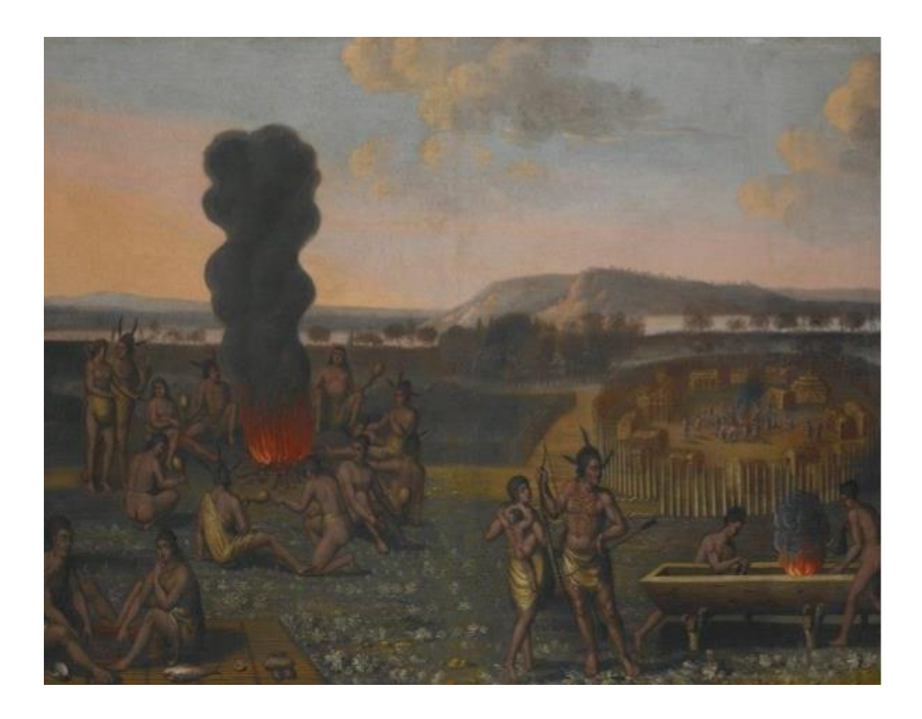
Image 1. 'Indians of Virginia,' James Woolridge, 1675. The colonial gaze: The spatial and aesthetic construction of domestication and value, against the underdeveloped and wasteful.

The distinction between waste and value provided colonialism with a logic of progressive development, structured through encounters of dispossession in the 'New World' (see image 1 above). However, the 'waste' of savagery was made knowable by the discovery of other wasteful and idle peoples within the 'Old World'. 'We have Indians at home, Indians in Cornwall, Indians in Wales, Indians in Ireland ', claimed leading Puritan colonist Roger Williams in 1652 (cited in Neocleous 2012: 953). The discovery of Indian savagery and its necessary eradication was both made possible and shaped by the treatment of other underdeveloped subjects. As Mark Neocleous (2012: 954) argues: