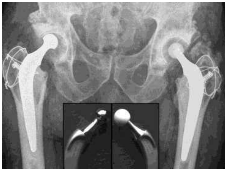
Figure 2: A pelvic radiograph of a patient with a conventional Charnley low friction arthroplasty, metal on non-crosslinked polyethylene bearing, and an alumina-on-cross-linked polyethylene bearing on the contralateral side. There was significantly greater wear in the conventional bearing.