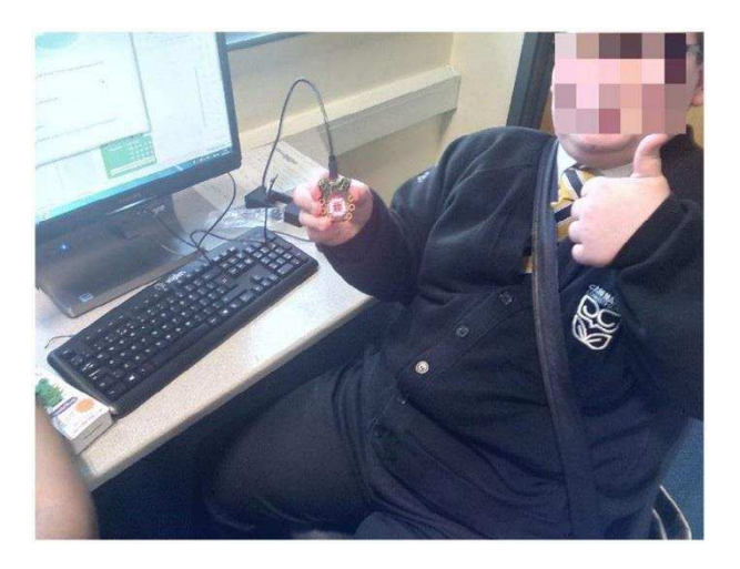
Figure 4. 'eureka' moment as the device worked as intended.

Jasmine: I think the word 'geek' is like ... a geek is someone ... they've got a social life yeah, and they can like go out and like be with friends, but they've got skills and, like, science-y type stuff and, like, computer and all that sort of stuff and loads of people, like, get geeks and nerds mixed up. Because stereotypically geeks are the ones who like to go out and they can do stuff with their friends, but they can also come in and do techy stuff, and nerds are just lonely, and just sit at a computer all day, just like this far away from the screens like (she puts her hand in front of her face).