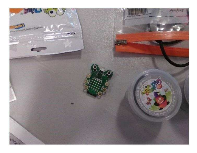
Figure 1. a Code bug – one of the micro-controllers used in the project.

Sam: So, my idea, I'm working in group but Ikana came up with the actual idea, and it's this cat flap that's connected to your phone and you can change whether the cat flap lets your own cat in, out or both ways or no way, like, locked. It's also ... the cat's also wearing a collar that it tells the cat flap whether it's in ... the cat is in or out or not. You can ... and you can ... it also stops any cat that's not your cat getting in, so like a cat, even with the same brand, it's got a different serial number or high, like, frequency so that it doesn't let anyone else's cat in, even if it's with the same brand. I just came up with this idea.