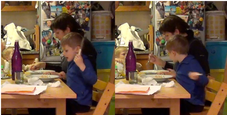
Figure 1: The boy leans forward as he begins his search in Extract 6.

In most of the previous examples it is evident that alongside visual sweeps and zooms, with manual sweeps and with verbal reports of the trouble, Self quite regularly makes adjustments to her/his corporeal deportment, which is to say to their body position. Generally such body movements bring Self closer to the presumed location or zone of the sought-for object. For instance compare the body position of the boy in the previous example as he begins to say hei 'hey', with his position a little over a second later as he passes his right hand round and under the rim of his dish (Figure 1).