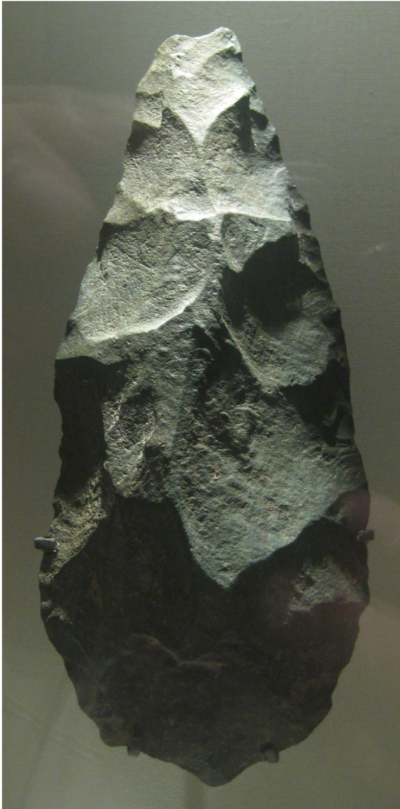
Figure 3. Olduvai handaxe, Lower Palaeolithic, about 1.2 million years old, Olduvai Gorge, Tanzania.