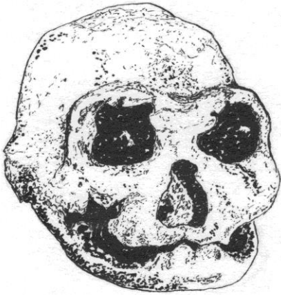
Figure 2. The 'toothless' Dmanisi hominin (author's own drawing)