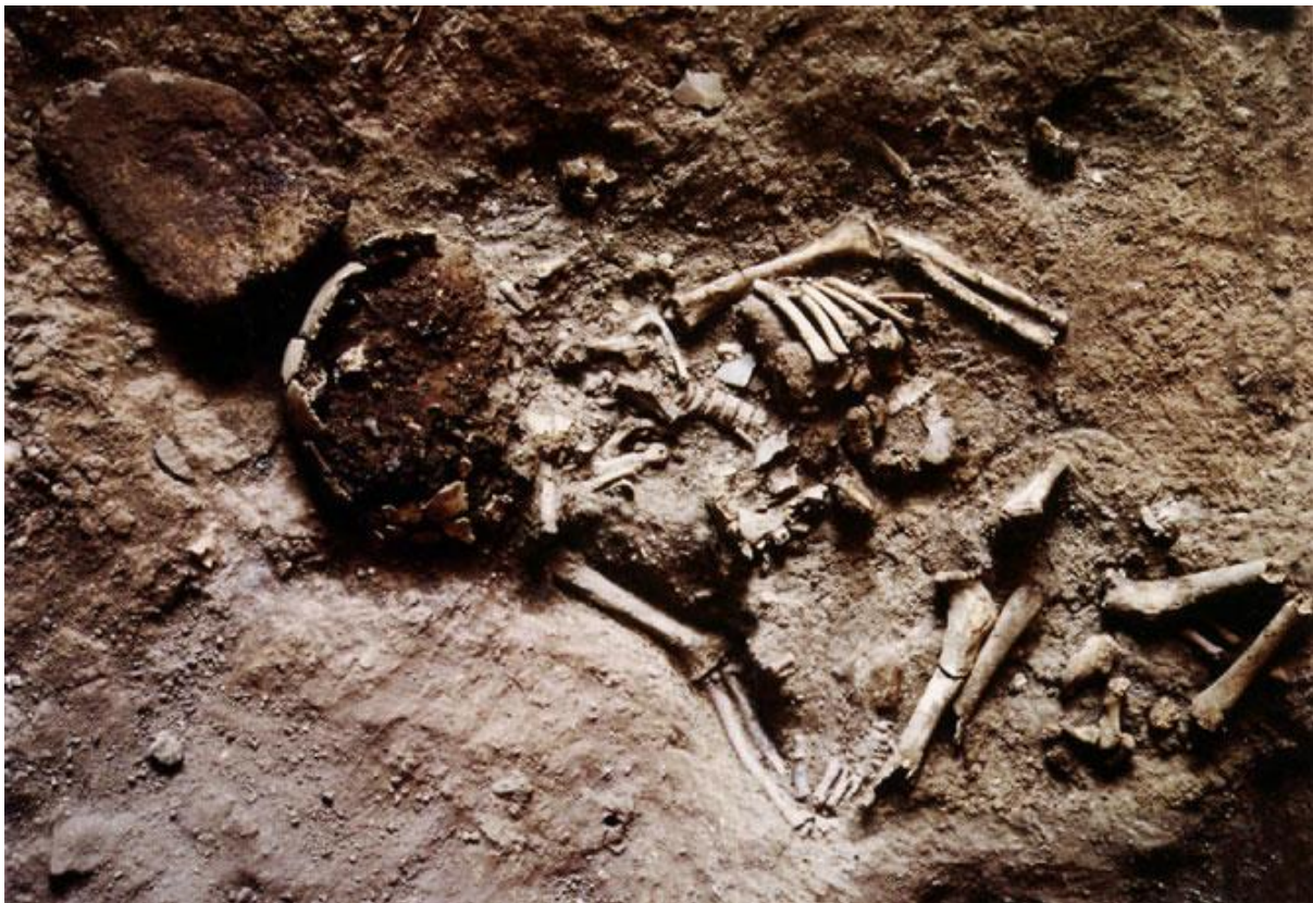
Figure 2. Dederiyeh 1, a two year old child found with a triangular flint on its chest and a stone slab next to its head

An intimate focus and concern with the wellbeing of children is reflected in Neanderthal burial. Currently over 20 burials of children have been discovered, with many showing signs of great care being taken. For example, the burial of a 2 year old child at Dederiyeh Cave in Syria (Akazawa et al. 1999) was laid out on its back, with arms extended and legs flexed, with a triangular flint placed upon its chest and a stone slab beside its head (figure 2). Further, a 10 month old infant recovered from Amud Cave, Israel, was found with a complete maxilla of red deer ( Cervus elaphus ) lying on its pelvis (Hovers et al. 1995). A number of sites have also produced multiple child burials, most notably La Ferrassie, France. Here, in addition to two adults, five children were discovered. This included a newborn found within an oval depression with three flint scrapers (La Ferrassie 5), and a 3 year old child with three stone tools and a limestone block with cupules above the grave (La Ferrassie 6) (Capitan & Peyrony 1912; Delporte 1976). Within the context of an inwardly focused society, we have previously argued this evidence represents a social and potentially symbolic focus on the young (Spikins et al. 2014).