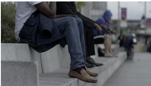
Figure 2 The act of sitting