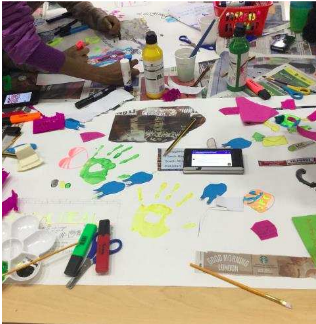
Figure 6: collage in progress

Conversely, the girls' works appeared more analytical, incorporating more handwritten text and quotes that they had heard and produced throughout the ethnographic linguistic landscape research period. These works also contained elements of the multilingualism within the neighbourhood as well as references to their personal interests, such as fashion.