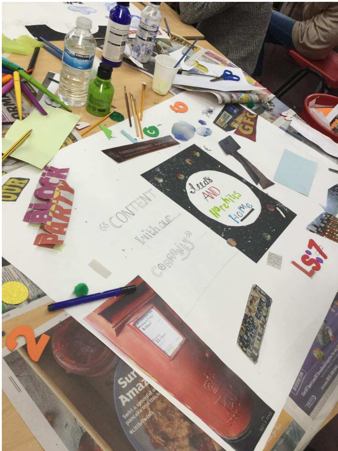
Figure 4: collage in progress

As a way of introducing colour to their work, participants applied cut out shapes from coloured paper and tissue paper which they also screwed up and glued to the surface to recreate the greenery of the park which they had seen and worked in earlier in the programme. Halfway through the session the groups were given paints to introduce