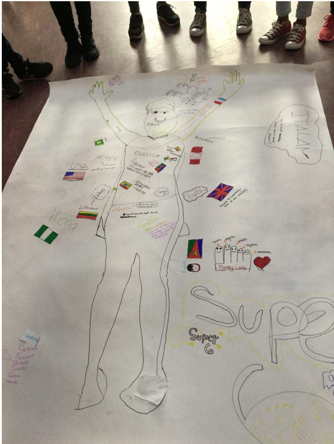
Figure two: group language portraits

We then conduct ethnographic explorations of the street and surrounding area in small groups using photography, video and interviewing of community members (e.g. shopkeepers), to develop understandings of the local semiotic landscapes and the meanings behind signs. This is based on the TLANG linguistic landscape research