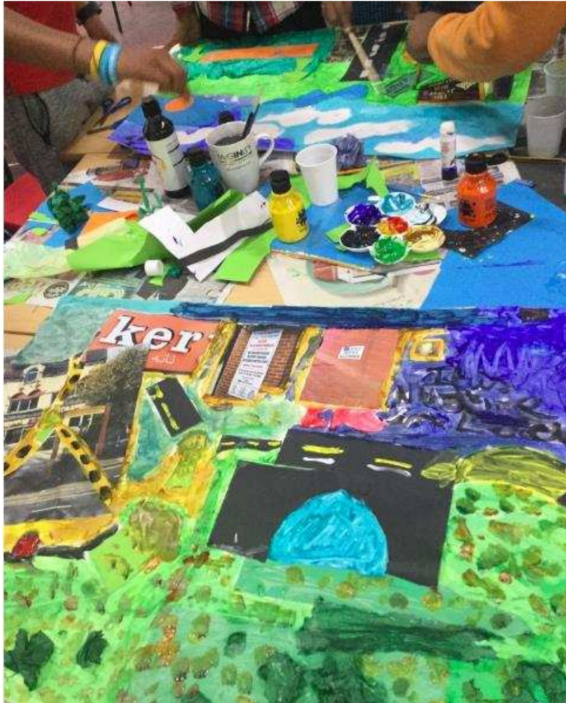
Figure 5: collage in progress

another layer of colour into their work. As well as a practical measure, this also allowed them to develop themes from the text and imagery before deciding how the colour might affect their collages.