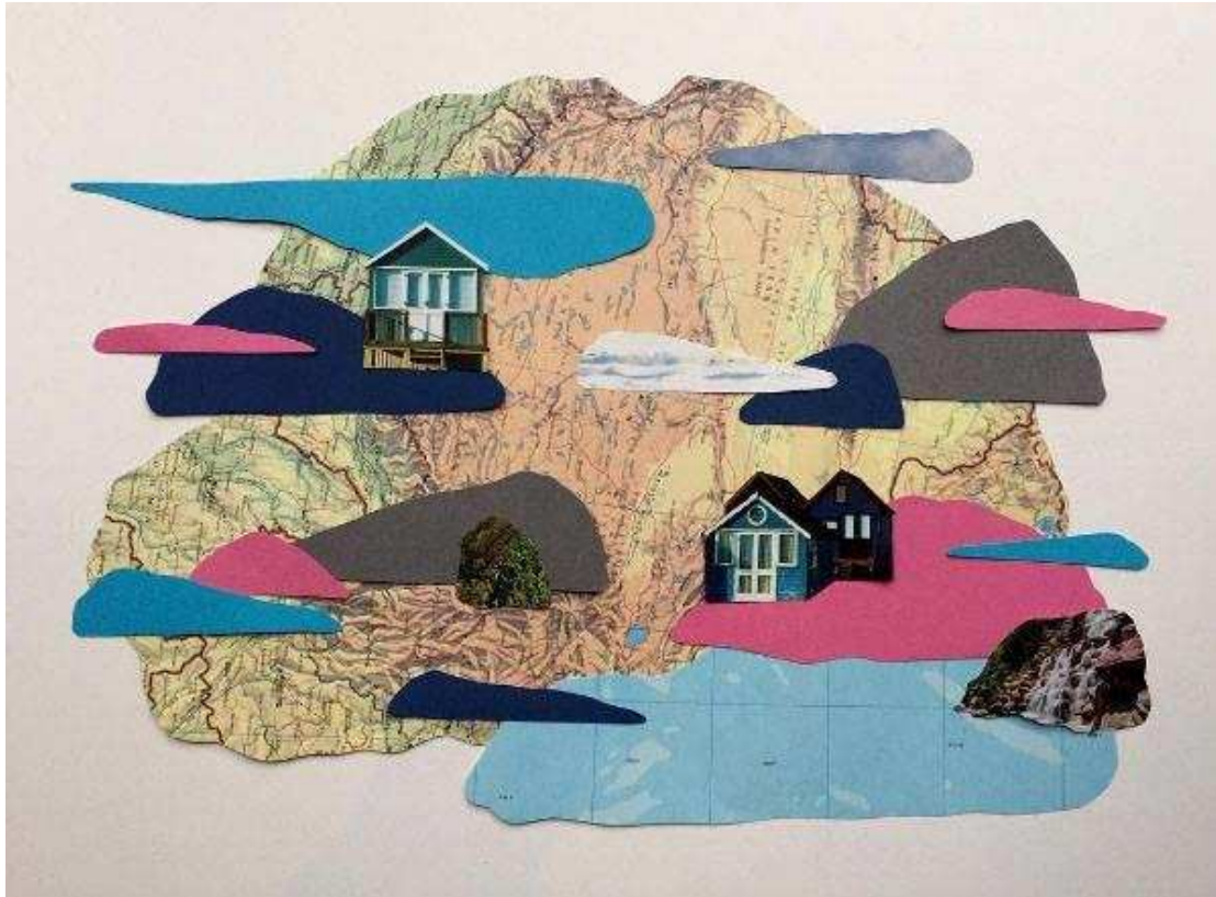
Figure 3: an example of Louise’s collages

In this way the creation of imagery of ‘place’ aligns with Jaworski and Thurlow’s (2010, p. 9) description of place as collective memory: