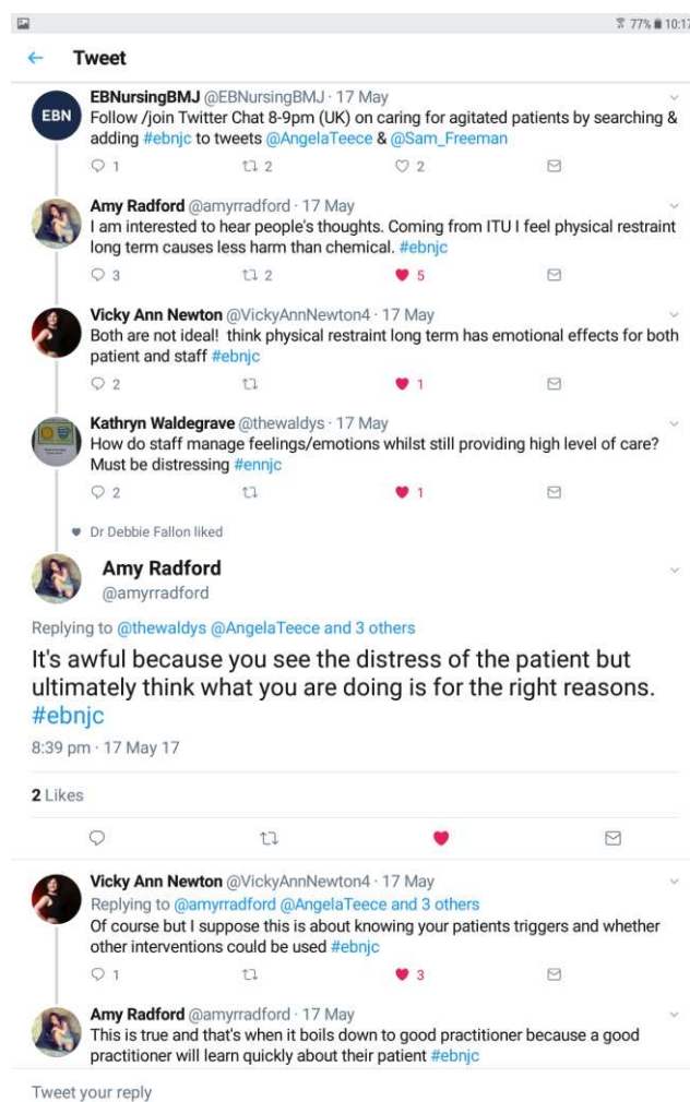
Figure 2: Concerns about restraining patients

have been shown to develop delusional memories, which can increase the development of post-traumatic stress disorder. 9 Validated tools exist to assist nurses in identifying delirious patients but subjective interpretation of delirium or agitation can lead to erroneous over-diagnosis of delirium. 10 Both the American College of Critical Care Medicine 11 and the UK Intensive Care Society 12 have published practice guidance that included the detection, prevention and management of delirium and agitation. Although approaches for managing ‘ dangerous motor activity ’ in the form of pharmacological interventions were outlined, there remains a lack of guidance for managing the acute event of a mobile, agitated patient who is a risk to themselves, visitors and staff. Although short term sedative use may reduce the agitation or anxiety, in the longer term their use may have significant cognitive consequences. 13 Participants described observing a range of forms of restraint, both physical and chemical, and perceived that clinical staff considered chemical restraint, such as boluses of sedative drugs as ‘kinder’, allowing the patient to ‘sleep’ (Figure 2). However, research suggests that the use of chemical restraint to deeply sedate an agitated patient can cause long-term mental health problems. 14