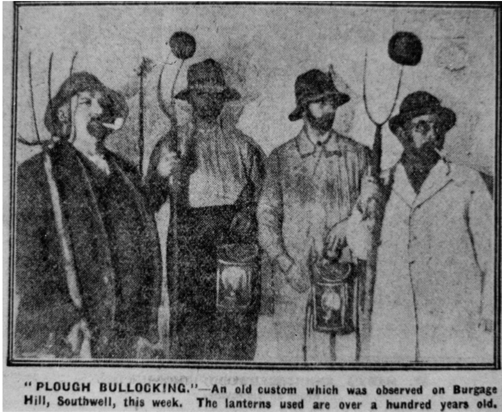
PLATE 2. A non-play Plough Monday Custom : Plough Bullocks from Southwell.