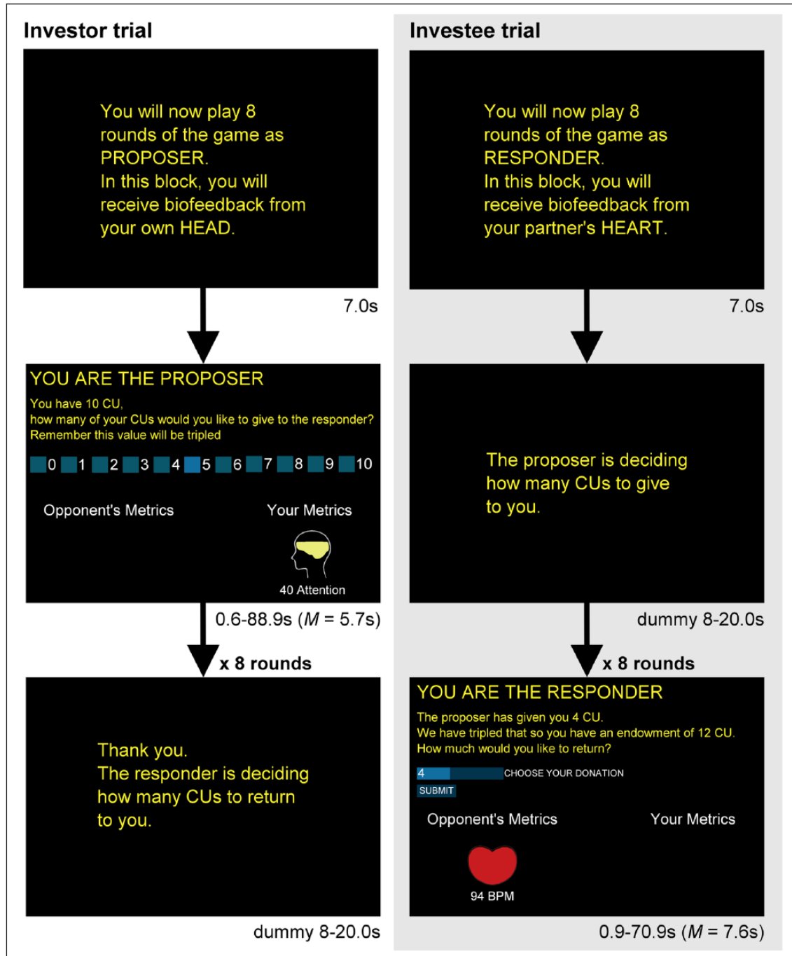
Figure 1. The user interface of the modified investment game, featuring an example trial as investor, with head (own) feedback, and as investee, with heart (partner) feedback, with response times in seconds. In the control (no feedback) condition, the feedback metrics appeared blank. Font sizes have been adjusted for illustration purposes.

playing the IG. Response times from presentation until decision (ms) were also recorded. For analyses, the measure of heart rate and attention recorded prior to each decision was used.