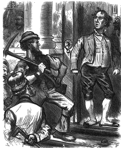
ENGLAND'S PRIDE AND GLORY.

Dizzy. "Bulgarian Atrocities! I can't find them in the 'Official Reports'!!!"