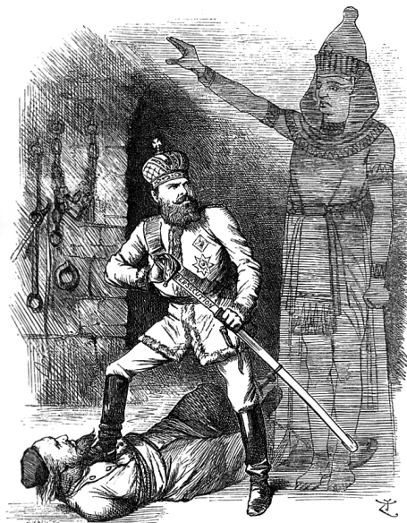
FROM THE NILE TO THE NEVA.

BRAND OF PHARAOH. "FORBEAR! THAT WEAPON ALWAYS WOUNDS THE HAND THAT WIELDS IT."