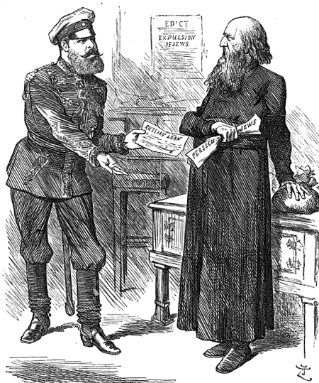
"BLOOD" VERSUS "BULLION."

"WELL THEN, IT NOW APPEARS YOU NEED MY HELP: YOU THAT DID VOID YOUR URUM UPON MY BEARD, AND FOOT ME, AS YOU SPURN A STRANGER CUR OVER YOUR THRESHOLD: MONKEYS IS YOUR GIFT. WHAT SHOULD I SAY TO YOU?"— Merchant of Venice , Act I, Sc. 3.