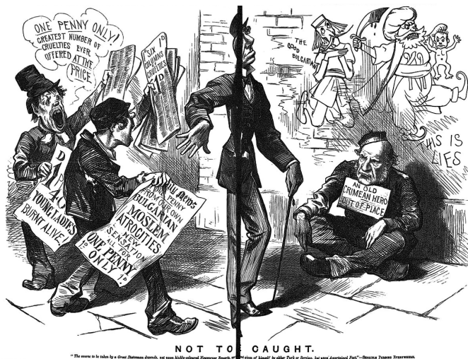
Figure 4. William Boucher, Not To Be Caught, in Judy , August 9, 1876. Private collection.