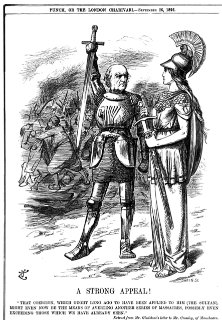
Figure 12 (right). E.T. Read, Design for Proposed Statue to be Erected in Constantinople , in Punch , September 26, 1896. Private collection.