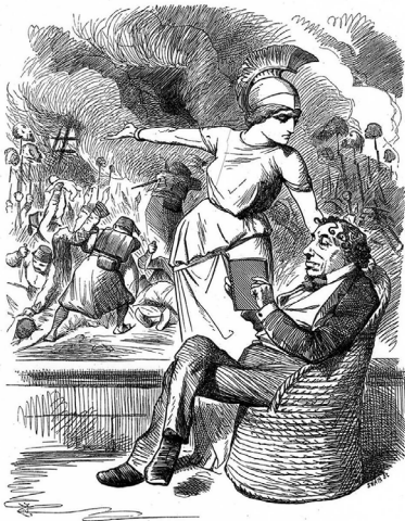
NEUTRALITY UNDER DIFFICULTIES.

Dizzy. "Bulgarian Atrocities! I can't find them in the 'Official Reports'!!!"