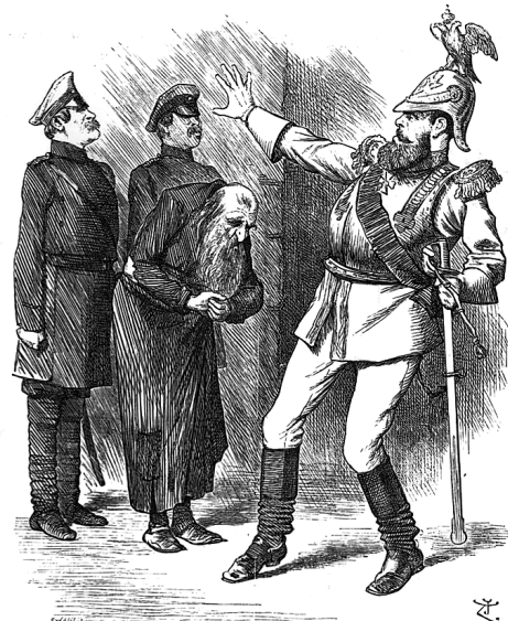
THE ALARMED AUTOCRAT!

"WELL THEN, IT NOW APPEARS YOU NEED MY HELP: YOU THAT DID VOID YOUR URUM UPON MY BEARD, AND FOOT ME, AS YOU SPURN A STRANGER CUR OVER YOUR THRESHOLD: MONKEYS IS YOUR GIFT. WHAT SHOULD I SAY TO YOU?"— Merchant of Venice , Act I, Sc. 3.