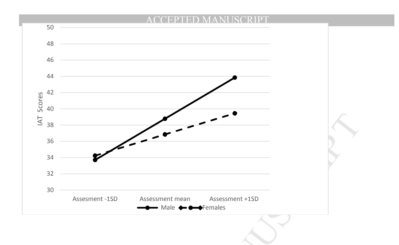
Figure 1: Means of IAT scores for male and female participants at 1 SD below, at the mean and at 1 SD above the mean of Assessment.