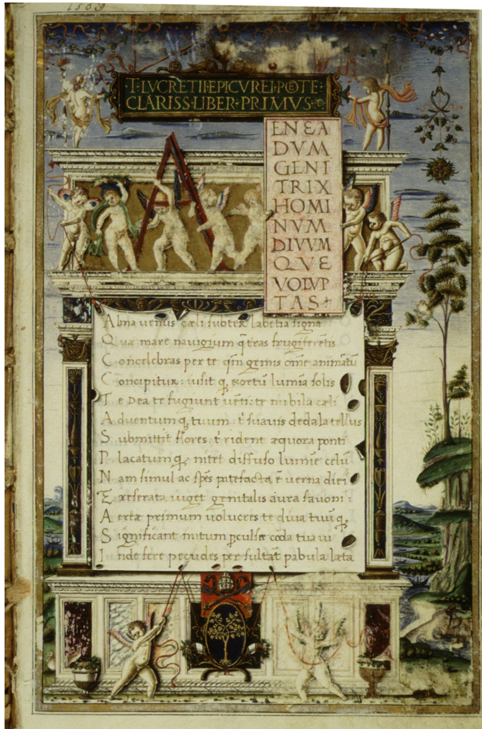
Figure two: Lucretius, De rerum natura , Vat. lat. 1569 fol. 1 recto medbio04 NAN.13