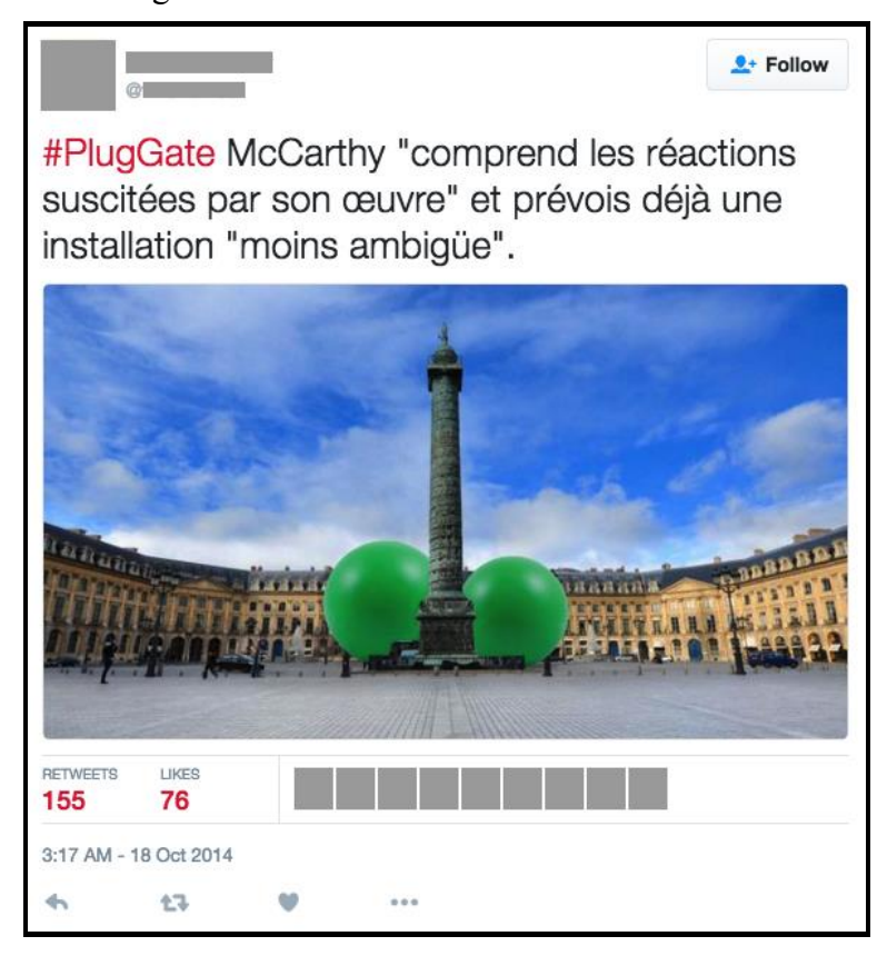
Figure 4 . A ludic response to Tree by a Twitterer. This photoshopped image became one of the trend-setting online Tree imageries (memes). Translation of the tweet: "#PlugGate: McCarthy 'understands reactions to his work' and is already planning a 'less ambiguous' installation."

In Figure 4, Tree -esque balls, in the same colour and plastic aesthetic as Tree , are 'added' to the base of the Column. This imagery queerly plays on the imagination. The Vendôme Column was covered by a construction box during the art fair but uncovered in the image, as if a condom were removed to elicit phallic worship in bare splendour. The "less ambiguous" representation in this posting is a frisky intervention in, or rather further provocation of, much online mediated discomfort about Tree . This post was soon retweeted over more than 150 times, an indication of network sociality (Miller, 2008).