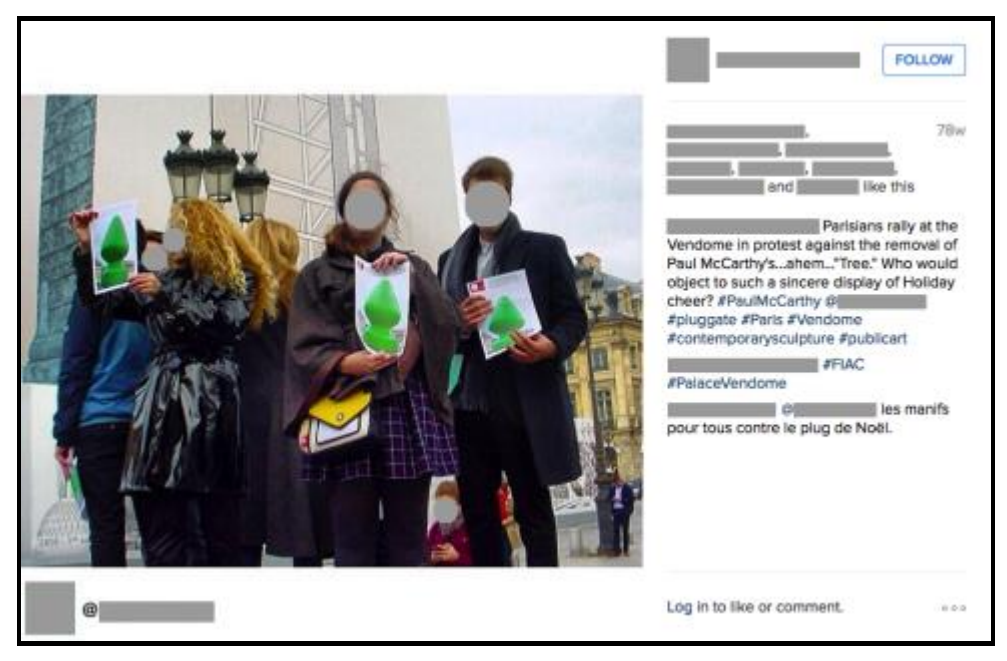
Figure 8 . An Instagram posting showing members of the public campaigning against Tree 's unanticipated earlier removal from Place Vendôme after the artwork was vandalised.

Offline engagements, such as illustrated in Figure 8, also fed back to online communities. Pro-campaigning was carried out in a lively way in the form of tweets such as "I plug Paris! The Great Lobby love pluging [sic] Paris!". But there was also some rather inconsiderate reuse of previous serious-laden campaigns. For instance, a Twitterer published an image of Michelle Obama holding a paper with the script: "#BringBackOur[image of a hand holding Tree ]". Similar to the use of the '-gate' suffix, this was done to recall the #BringBackOurGirls hashtag in the (social media) outrage over the mass abduction of school children by Boko Haram in Nigeria in 2014.