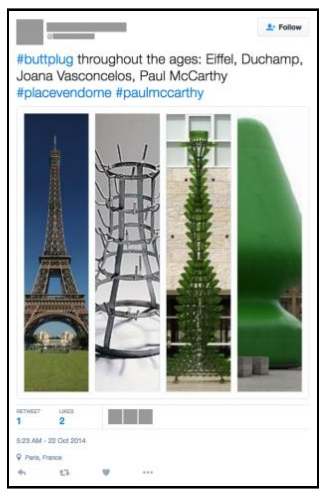
Figure 7 . A tweet with photo compilation situating Tree in the ambiguous historical trajectory of rejected/accepted and temporary/permanent artworks that have eventually grown into (inter)national cultural heritage spectacles. Is Tree perhaps a notable successor of offline landmarks within the digitally networked society today?

Reverting to the tweet in Figure 7, which I conceptualise as digital time machine of Tree , I queery whether this artwork might become an emblematic monument, but then in the context of digital culture. The online 'infomediation' travel agency Easyvoyage satirically counter-voiced the well-trodden 'romantic' Eiffel Tower-steered imagination of Paris: