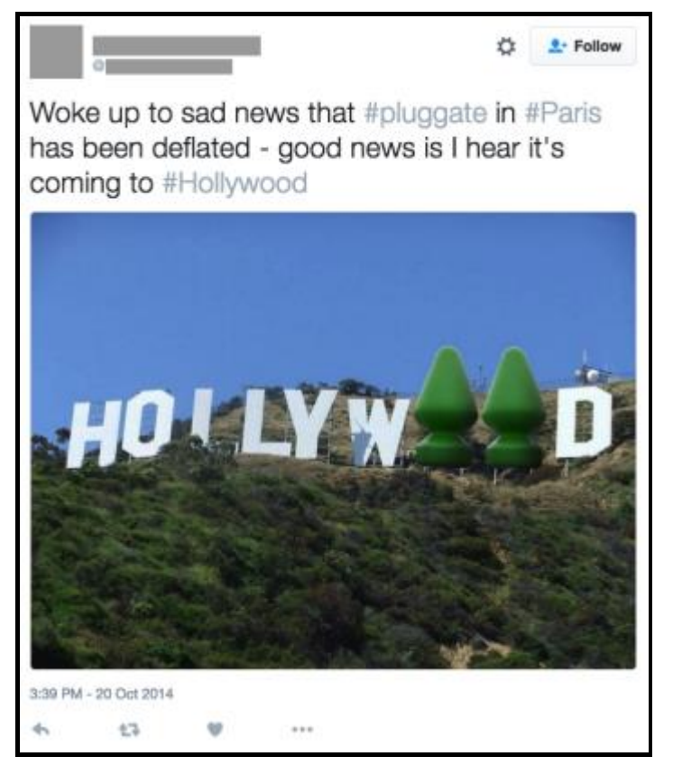
Figure 6 . Example of public user-created content on Twitter. This post shows a tweet and manipulated photo, presenting a playful welcoming of Tree to Hollywood.

User-created content, such as the photomontage in Figure 6, can be comprehended as simulacrum of real-world contexts. Such content mostly assembled visual and textual materials about Tree , which were often edited based on second-hand digital content retrieved from publicly accessible social media accounts. Sometimes users also included first-hand photographic material (see Figures 1 and 2). The user-created content as shown in Figure 6 appeared to be fairly professionally photoshopped. Potentially, this created a sense of realness, as if Tree were re-sited in 'real' place. This post acted as digital portal to connect global online users and to let them experience Tree in a location different from its original incarnation.