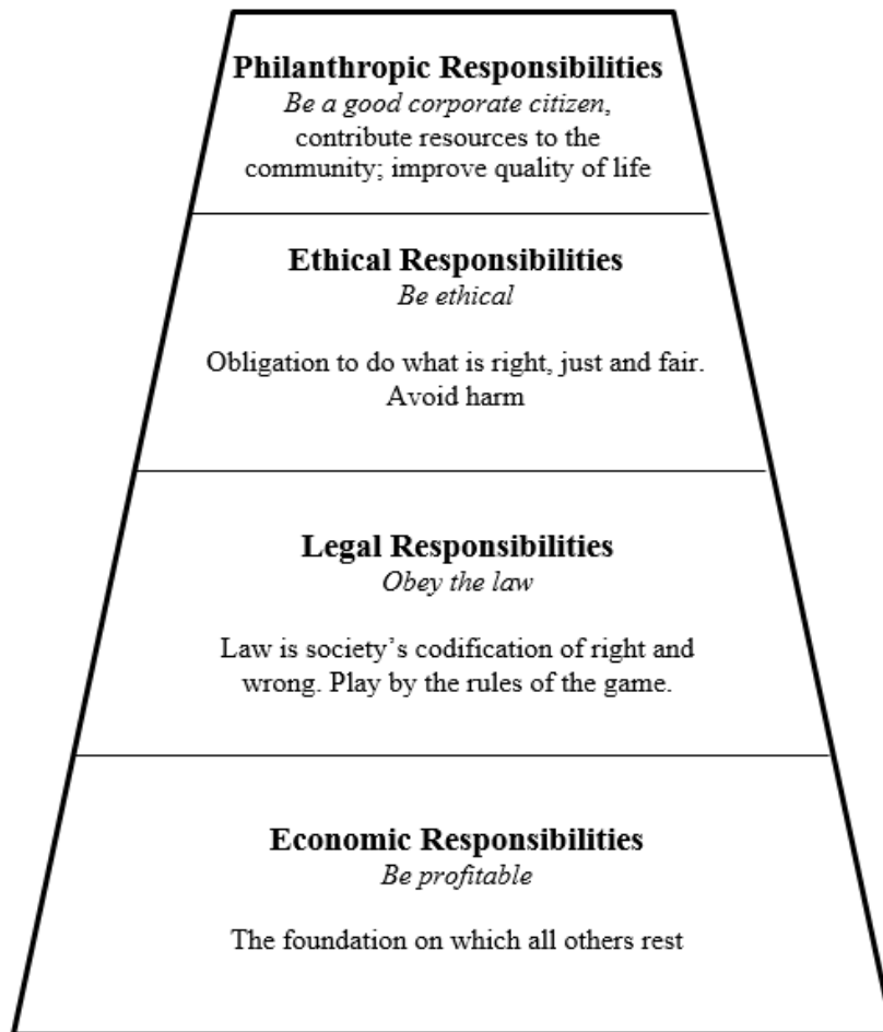
Figure 2: The CSR Pyramid from Carroll (1991)