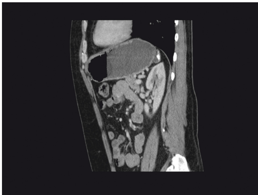
Figure 2 Computed tomography.

The computed tomography (CT) scan has shown a posterior gastric fundal diverticulum (Figure 2), containing calcified material and measuring approximately 30