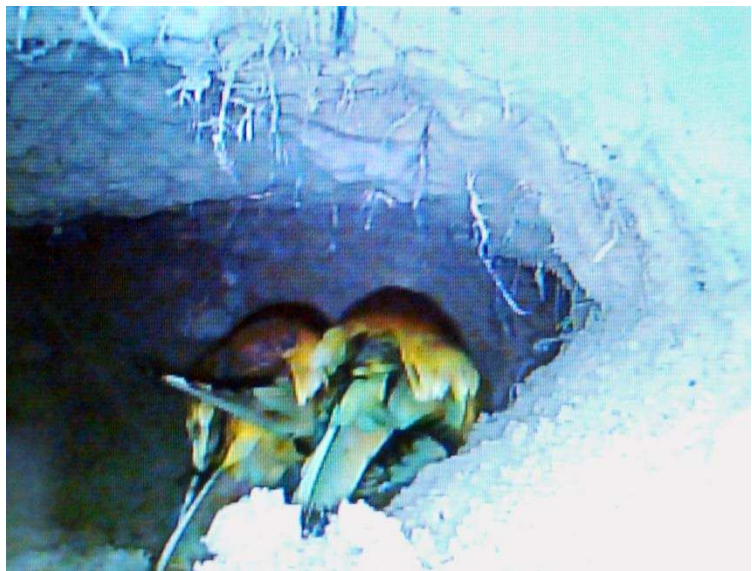
Figure 2: Endoscope picture showing pair-sleeping of European Bee-eaters - May 31 st 2014, 8:10 PM, Susak Island.