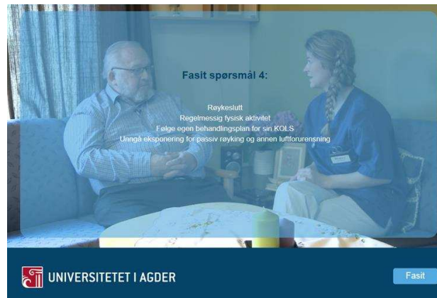
Fig. 3. Screenshot of the RN explaining the right answers, which is overlaid by a transparency showing the correct answers when the user presses the “Fasit” button to pause the scenario.