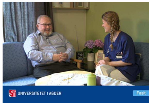
Fig. 1. Screenshot of the home healthcare setting in the SG scenario.

The video clips and questions were assembled, and the necessary information and instruction of use were integrated. The SG was named “Jeg får ikke puste” (I cannot breathe). As suggested by Olsen et al. [17], the development process included repeated testing of the prototype prior to the usability evaluation. Screenshots of the SG prototype are presented in Figs. 1-3 with permission from the actors.