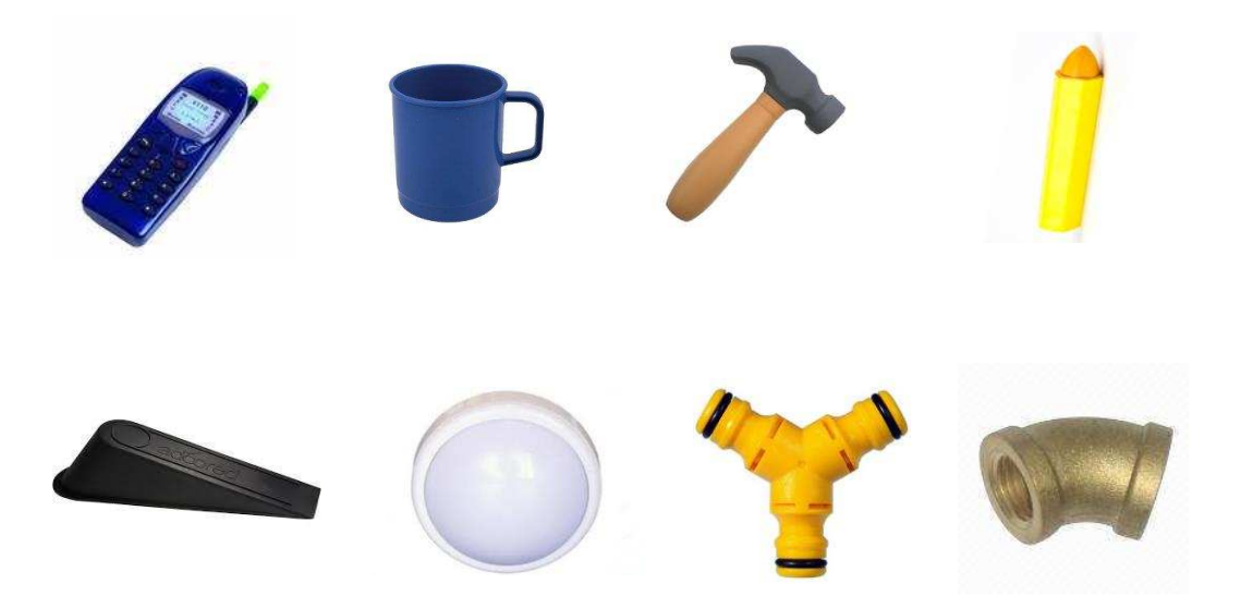
Figure 1. The eight objects used in Experiments 1 and 2. The familiar objects were a phone, a cup, a hammer and a crayon. The unfamiliar objects were a doorstop, a touch-light, a hose part, and a plumbing part.