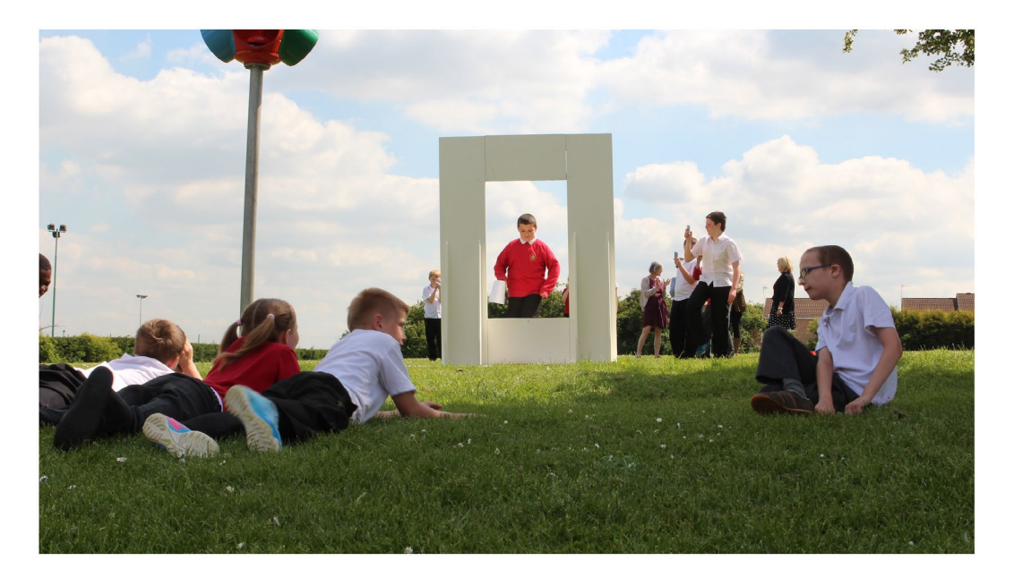
Figure 2. School children from Rawmarsh step through the 'Portal to the Past'.

it's critical that they found their own area of enquiry and then researched it themselves and that doesn't necessarily mean that they went in books it could mean that they asked each-other what it could feel like to go down the pit or what it would be like to be in the war or what it would feel like to win the World Cup, so it was a very personally-centred research process. (SP)