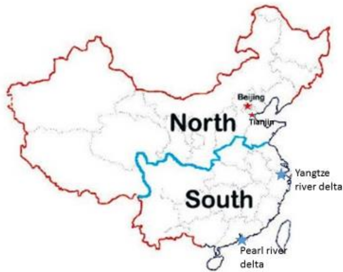
Figure 2. China map showing north and south regions.