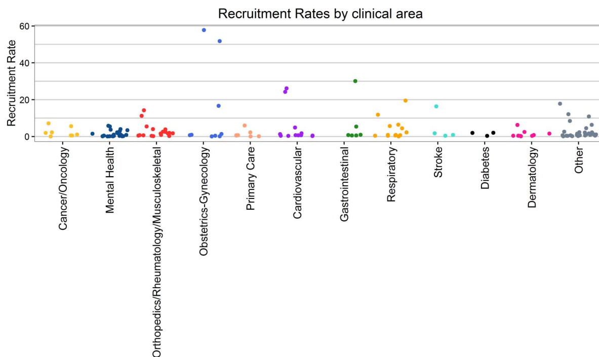
Figure 2 Recruitment Rates by clinical area for the 151 Health Technology Assessment trials considered.