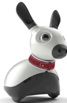
Figure 1. The MiRo Robot

The MiRo robot is one of the few animal-like robot platforms that aims to be biomimetic in both aspects of its form and control. Moreover, MiRo is the first commercial robot to be controlled by hardware and software modelled on the layered architecture of the mammalian brain [2]. A brain-based biomimetic control system, 3B-CS , based on twenty years of research in computational neuroscience and brain-based robotics at the University of Sheffield, allows MiRo to behave in a life-like way based on control system components that mimic, at an abstract level, some of the major sub-circuits of the mammalian brain. This architecture is easily extendable with new behaviors by specifying their trigger stimuli and by applying a brain-based action selection system that decides between competing behavioural alternatives in real-time.