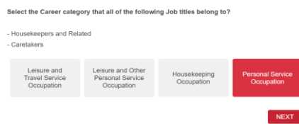
Fig. 5. A representation of Housekeeping Occupation (a Category concept in the Occupation hierarchy with two subclasses) was shown to a user, who identified it as “Personal Service Occupation”.

Applying Strategy 2 in Algorithm 1 over the Occupation and Subject class hierarchies in the L4All dataset, we considered naming a category entity with its exact name or a name of its parents or its non-leaf subclass members shown to the participants. Figures 5 and 6 show examples of the category identification task from the Occupation and Subject class hierarchies respectively. For instance, the participant in Figure 5 saw two leaves (the category has two leaves only) of the category Housekeeping Occupation and the participant identified the category's parent Personal Service Occupation, which he/she thinks that the leaves belong to. This will increase the frequency for the category Personal Service Occupation. In Figure 6, a participant was shown the leaf names of the category Biological Sciences (four random leaves where selected among 9) and selected its exact name. This will increase the count for the category Biological Sciences.