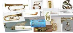
Fig. 4. An image of Brass (Category concept in the data graph) shown to a user, who named it as “Trumpet”.

In each of the two sets, entities with frequency equal or above two (i.e. named by at least two different users) were identified as potential BLO. The union of Set1 and Set2 gives BLO. It includes musical instruments such as: Bouzouki , Guitar and Saxophone . The BLO obtained from MusicPinta are available here 8 .