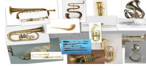
Fig. 4. An image of Brass (Category concept in the data graph) shown to a user, who named it as “Trumpet”.

In each of the two sets, entities with frequency equal or above two (i.e. named by at least two different users) were identified as potential BLO. The union of Set1 and Set2 gives BLO. It includes musical instruments such as: Bouzouki, Guitar and Saxophone. The BLO obtained from MusicPinta are available here 8 .