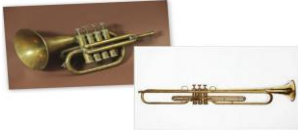
Fig. 3. An image of Trumpet (a Category concept in the data graph with two subclasses) was shown to a user, who named it as “Trumpet”.