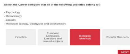
Fig. 6. A representation of Biological Sciences (a Category concept in the Subject hierarchy with four random subclasses) was shown to a user, who identified it as “Biological Sciences”.