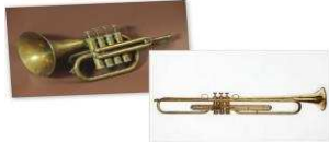
Fig. 3. An image of Trumpet (a Category concept in the data graph with two subclasses) was shown to a user, who named it as “Trumpet”.