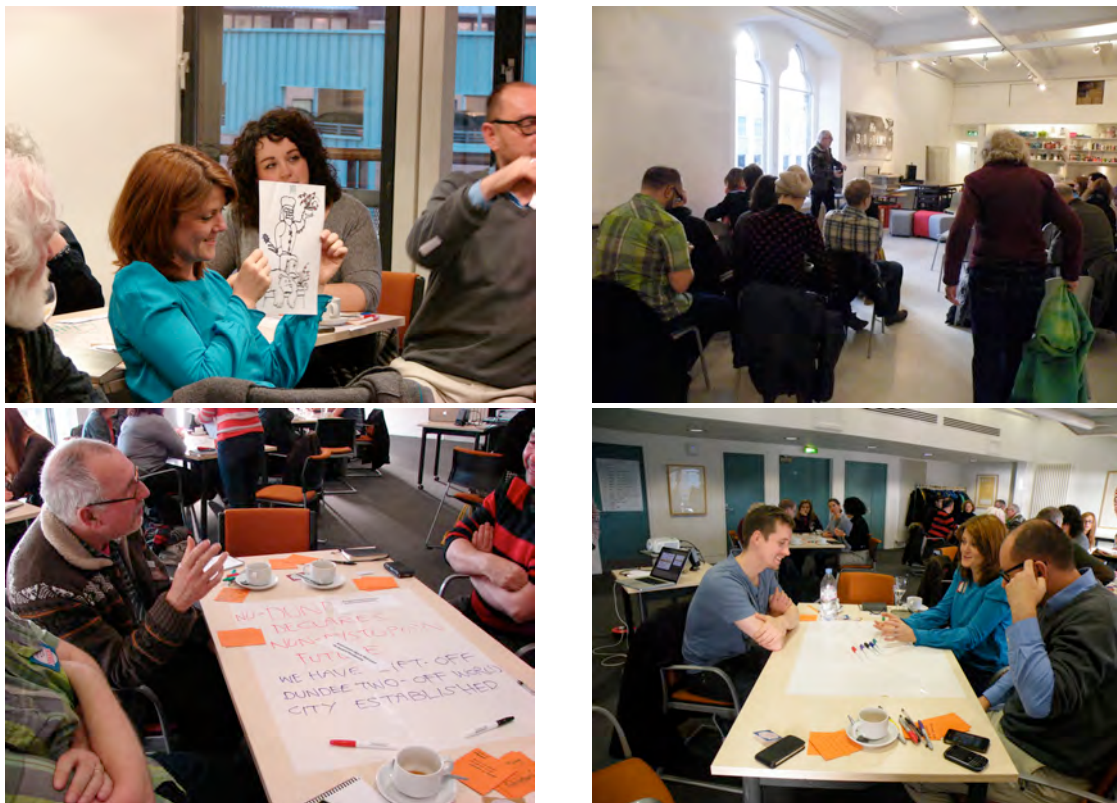
Figure 3: Storystorm Dundee workshop group activities.

participants registering and attending for the day. Storystorm Dundee was the kick off event for the CCN+ network and was delivered in conjunction with Bookweek Scotland. It explored the role of storytelling methods in developing, capturing and replaying the significant narratives of a city, this issue being derived from the earlier scoping exercise described above. The workshop itself was designed to intersperse curated guest speakers with facilitated workshop activities (Figure 2) and participants were given the opportunity to discuss each presentation. Each speaker reflected on contemporary challenges for storytelling, authorship, expertise and implementation for the City, it's past, present and future. Presenters Matt Locke (Storythings) gave a talk about 'The Future of Storytelling', Gillian Easson (Creative Dundee) presented 'WeDundee Crowdsourcing', Rod Gordon (MacManus Galleries) revealed the issues and opportunities for 'Oral Histories' and Nick Taylor (University of Dundee) spoke about 'Civic Engagement and Social Tools' to support storytelling and insight gathering.