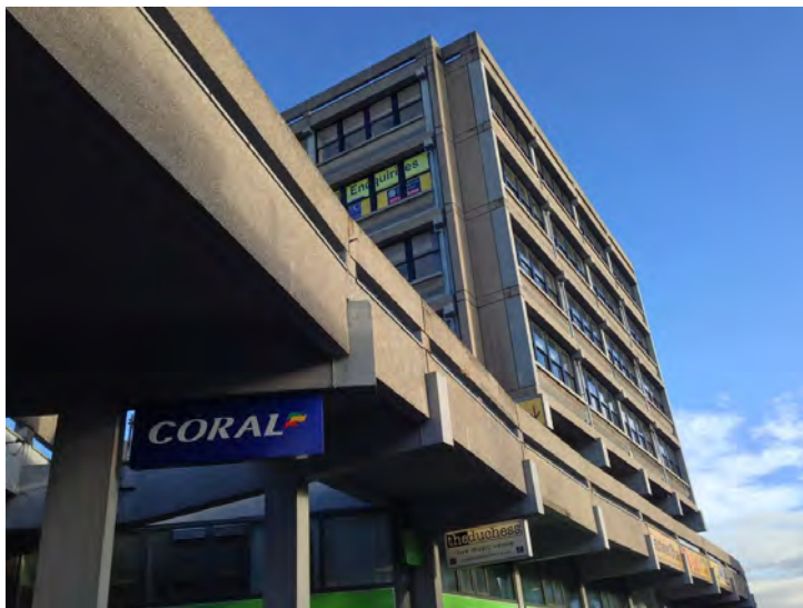
Figure 4: Stonebow House, built in 1964.

At the end of the April event there was a strong sense that more work needed to be done to develop the stories shared into something that might meaningfully engage with any future decision-making. Out of this event we devised a follow up event – held in July 2014 – the focus of this event was to think less about ‘opinions’ often solicited in consultation but to think instead of ‘arguments’ and people being exposed to other people’s and testing and developing their own.