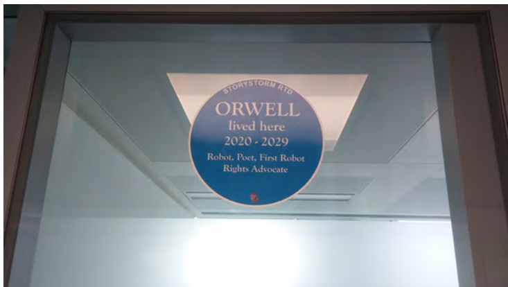
Figure 6. 'Orwell Lived Here 2020- 2029, Robot, Poet, First Robot Rights Advocate'. Plaque at Microsoft Research, Cambridge, UK.

StoryStorm presented a novel method that draws on the specific cultural context of Blue Plaques to generate reflective, nano-stories. English Heritage Blue Plaques pepper the UK landscape expounding officially validated narratives celebrating past events, people, and buildings. The 'Guerrilla Blue Plaque Method' helped to articulate issues through telling stories of the near future. The team had adopted the Blue heritage plaque previously in Manchester and this workshop and exhibit refined the idea of co-creating stories set in the future. The stories themselves were co-created, focused but emergent, with themes and near future issues influenced by the RTD conference and exhibition, research at Microsoft, the history, issues and culture of Cambridge, and news in general. The plaques populated the environs of Research Through Design Conference, for example Figure 6, and the city of Cambridge.