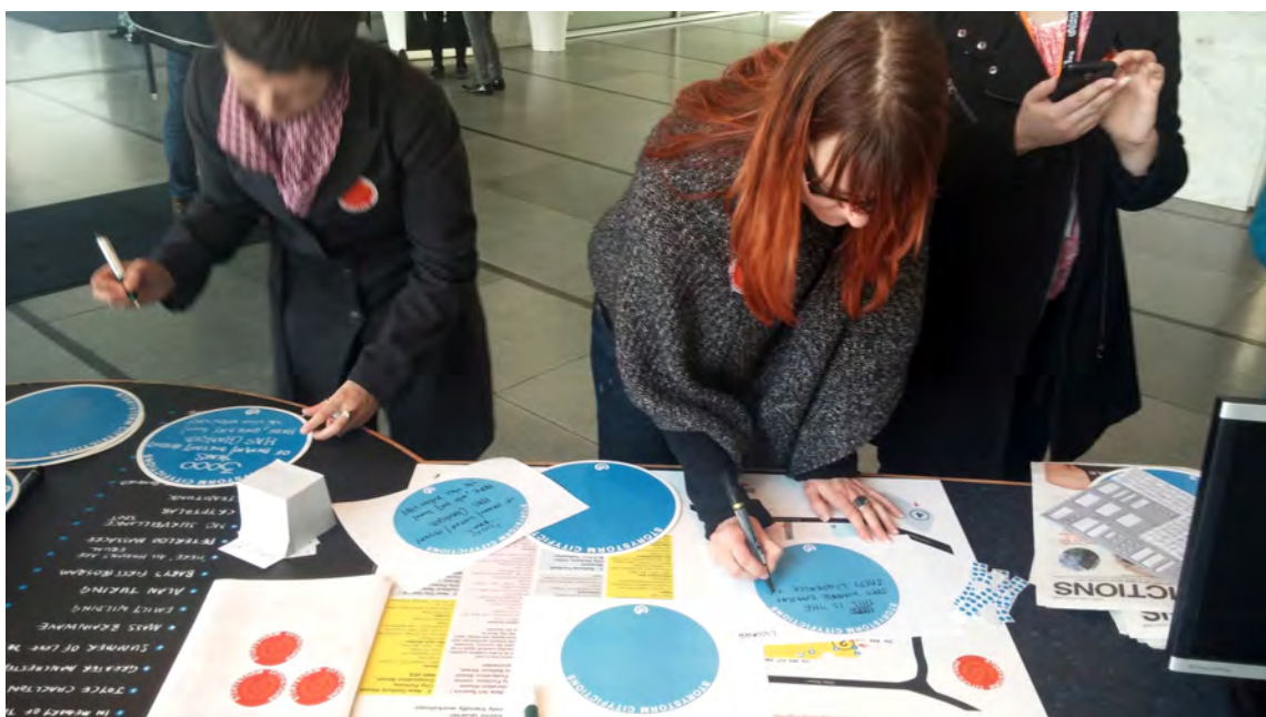
Figure 5: Storystorm 'desk' with map, index of plaques and Storystorm

Storystorm Manchester happened in over the course of two days from 29 th – 30 th March 2014. The event saw the team adopt a new conceptual approach and method for workshop delivery in order to engage participants in collaborative storytelling activities. The team adopted personas of tour guides, and presented Storystorm as a forum for citizens and groups to try out or respond to any area of civic future. A futures facing institute 'The tourism and heritage working group' to help guide a series of tours in order to commemorate important local events, many of which resided in the future.