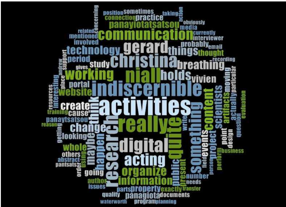
Figure 2: Word frequency cloud

In what follows we present and discuss the key findings in accordance with the aims and objectives of the study.